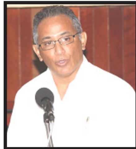
Hon. Johnny Briceno

que ha presentado el Primer Ministro para el ano 2011-2012, nos vamos tener que conformar que comer las tortillas solo con sal, ya que ni para la mantequilla nos va a alcanzar."