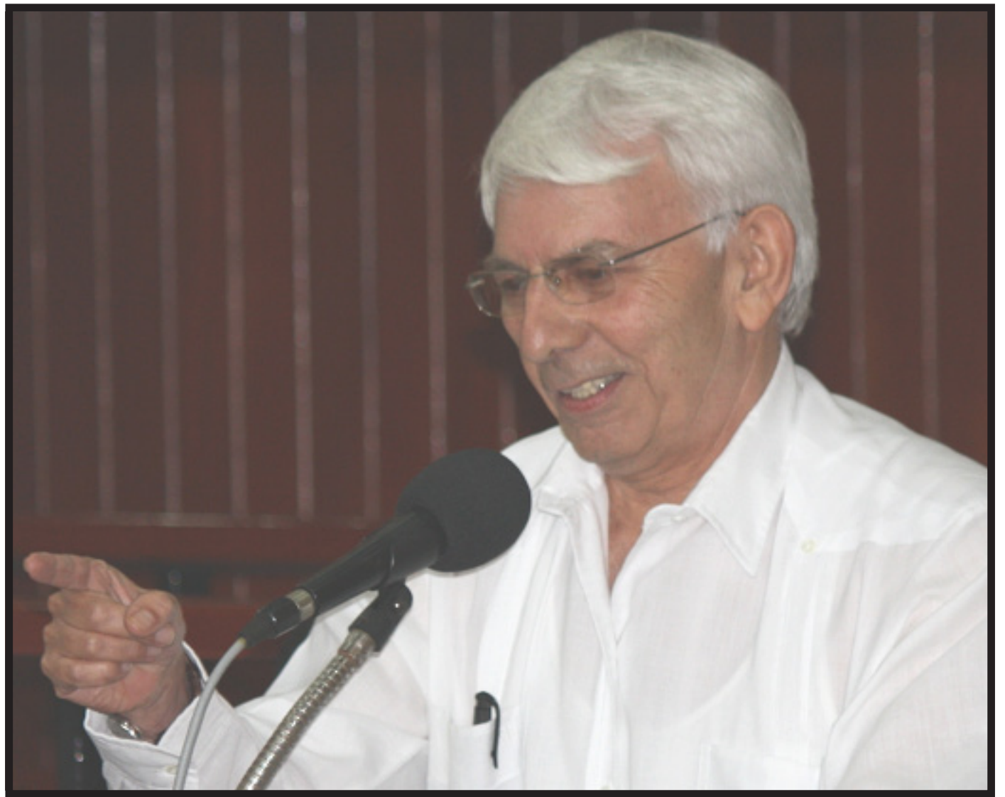
Hon. Said Musa making light of serious matters

And you know why we can be doing the roundabout at the Placencia Junction right now, an outstanding roundabout? Because we have savings. I know that's a strange word for you members on the other side. So let me say it slowly: S-A-V-I-N-G-S. So, we didn't have to borrow any more money. We got the road done, and we have e-x-t-r-a m-o-n-e-y.