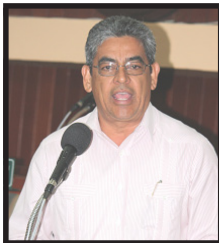
Hon. Gaspar Vega

It didn't have much to do with the substance of the debate on the budget, but a feisty exchange between rival political leaders from the north made for much drama and comic relief in the midst of a turbulent session that certainly could have used some laughter.