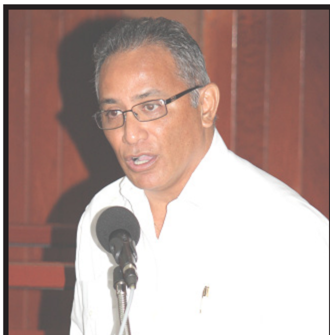
Hon. Johnny Briceno