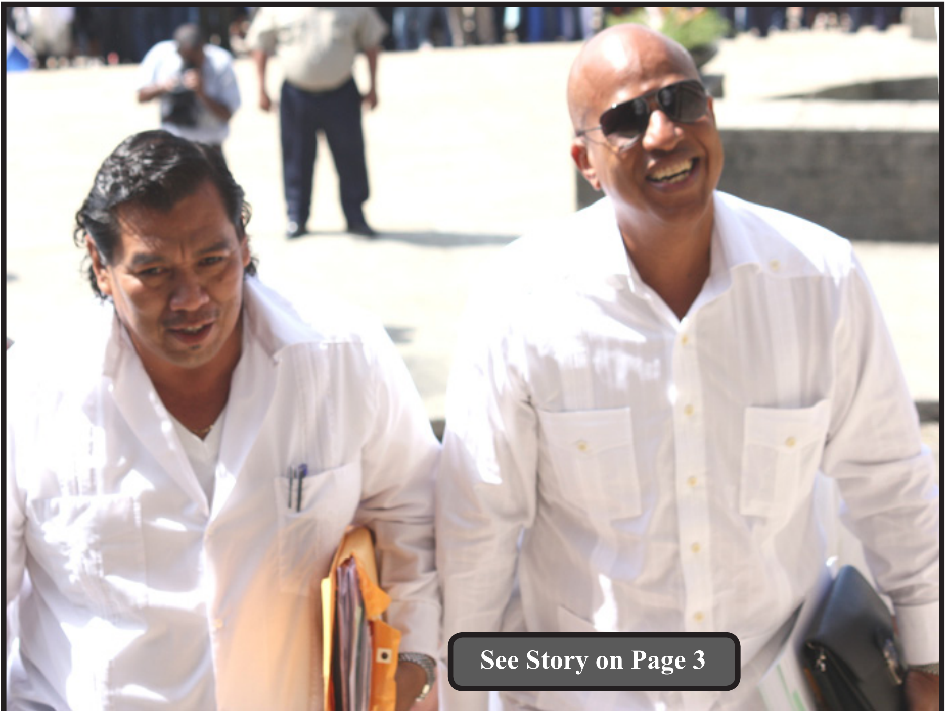
Hon. Ramon Witz and Prime Minister Dean Barrow mounting the steps of the National Assembly for the Budget Debate last Thursday