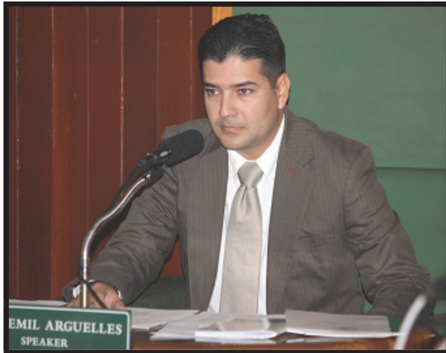
Hon. Emil Arguelles, Speaker of the House

Put it in context of 2007, the last full year of the People's United Party when they barely managed 1.5 percent growth. And we are comforted to know, Mr. Speaker, that we are on a recovery path that is sustainable; sustainable Mr. Speaker, because of the wise and prudent policies of this United Democratic Party Government. Sustainable, Mr. Speaker, because ours is not a government of bloated contracts, not a government of sweet heart deals; sustainable, Mr Speaker, because ours is a government of honesty, accountability and transparency. What we cannot afford, Mr. Speaker, is to have another PUP government come in and erode the gains that we have made under the UDP. What we cannot