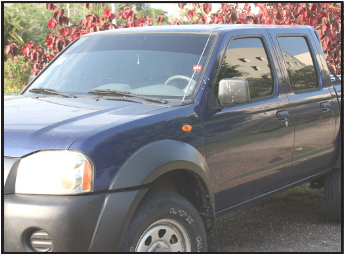
For sure a vehicle with more than the prescribed limit of tint

This new and revised legislation is the first of a number of other Statutory Instruments which will be signed into law with the view of amending existing, antiquated regulations governing Motor Vehicle and Road Traffic.