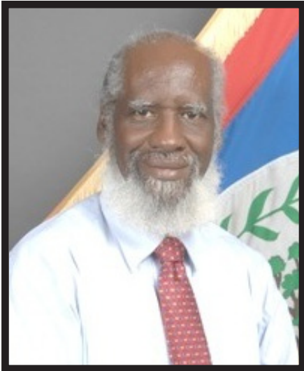
Hon. Wilfred Elrington

Whereas the problems that now face our country are undoubtedly the case of violence, the case of unemployment, the case of homelessness, the case of desperation, it is not the natural course of history that caused that. That was caused largely because the early founding fathers of the