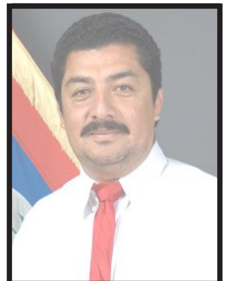
Hon. Erwin Contreras