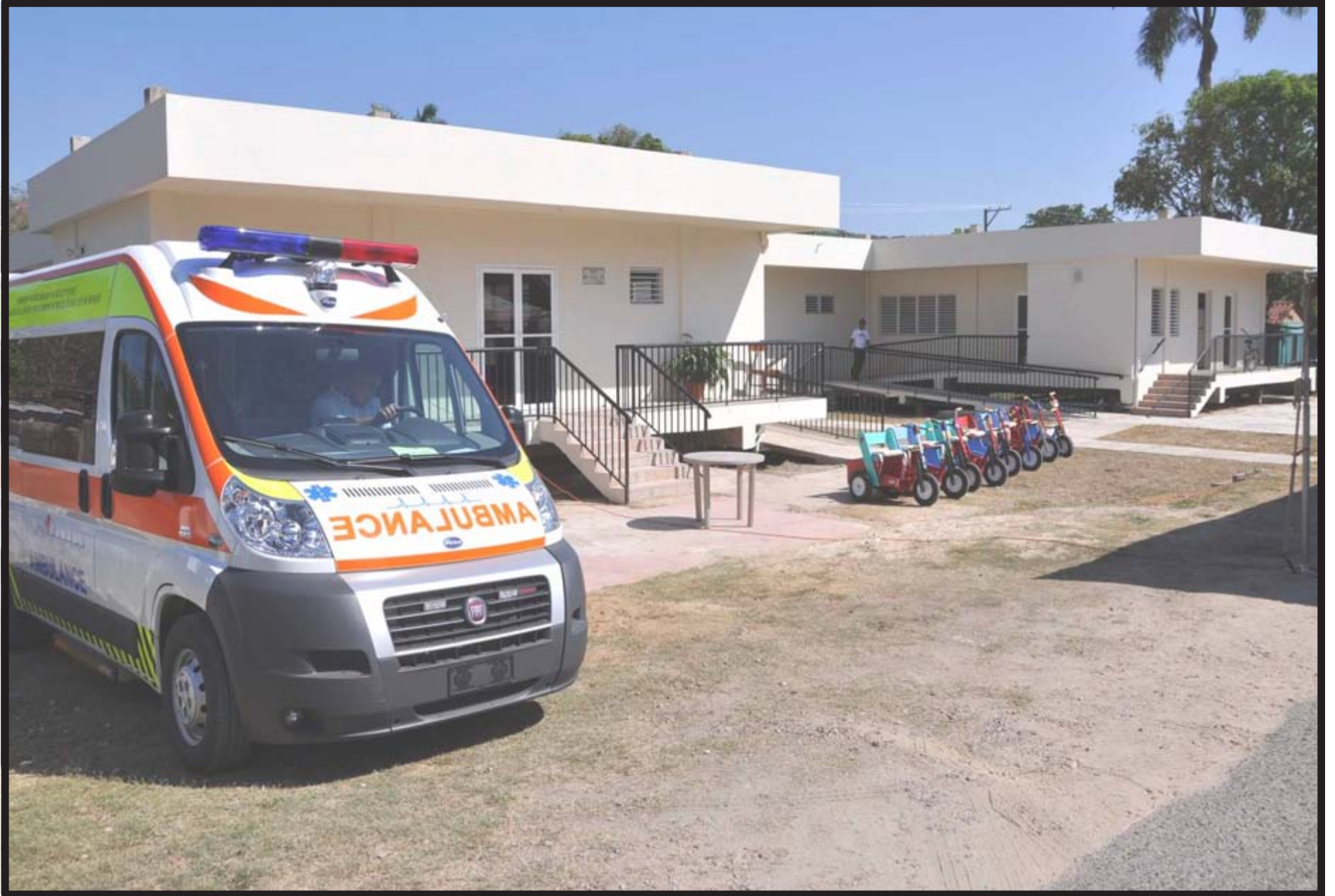
The newly constructed Polyclinic in Benque Viejo