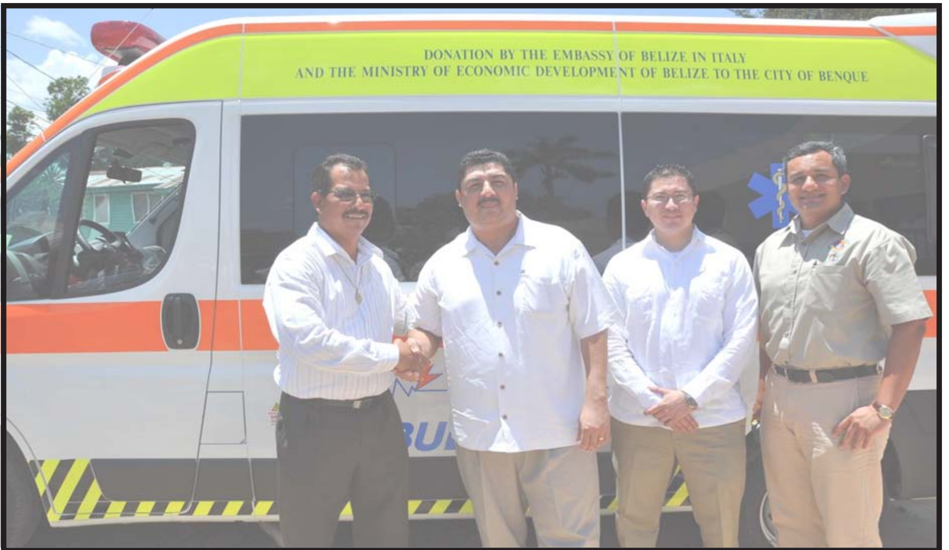
New Ambulance to serve the area