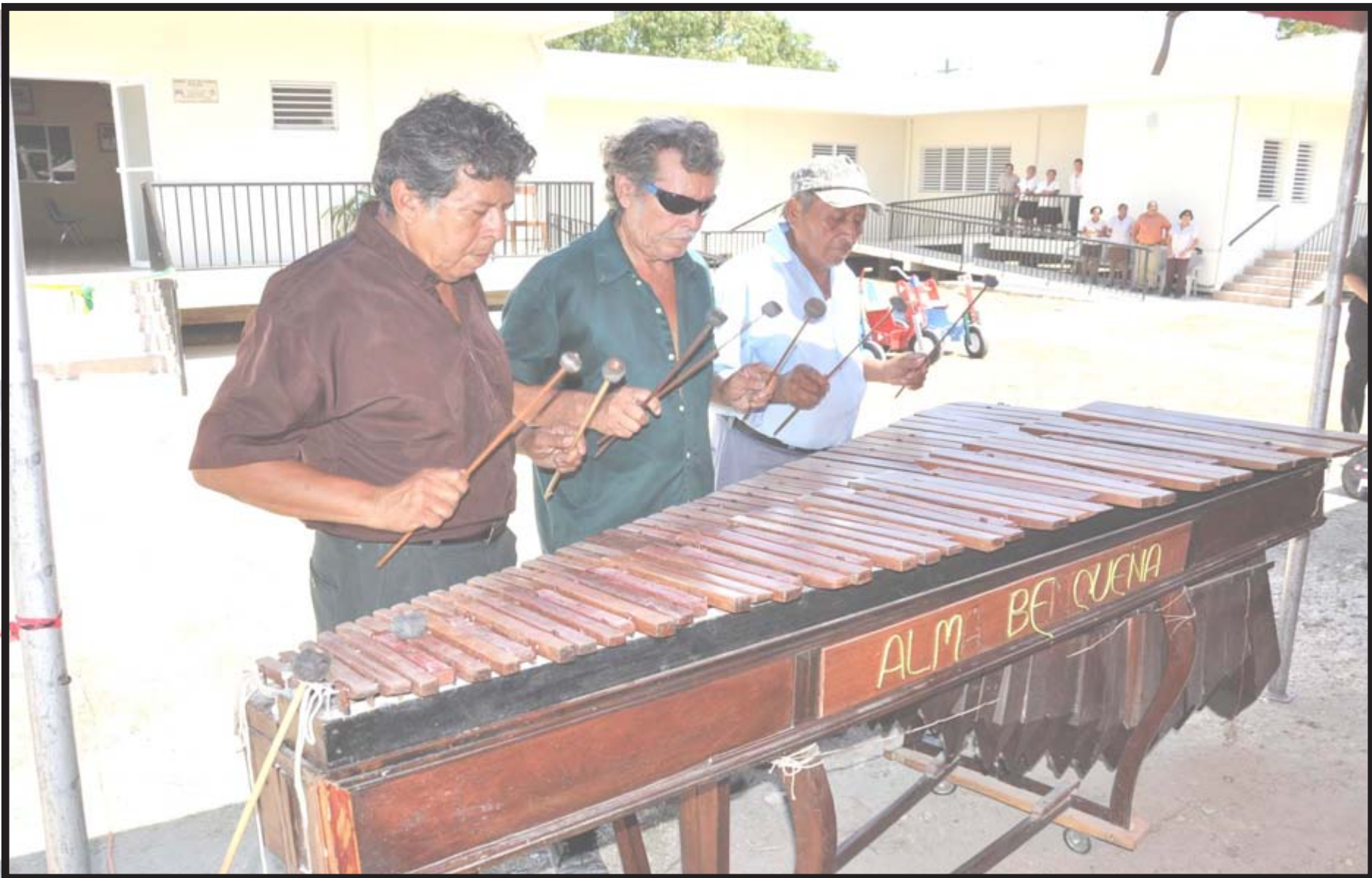
Marimba playing the national anthem at the inauguration ceremony