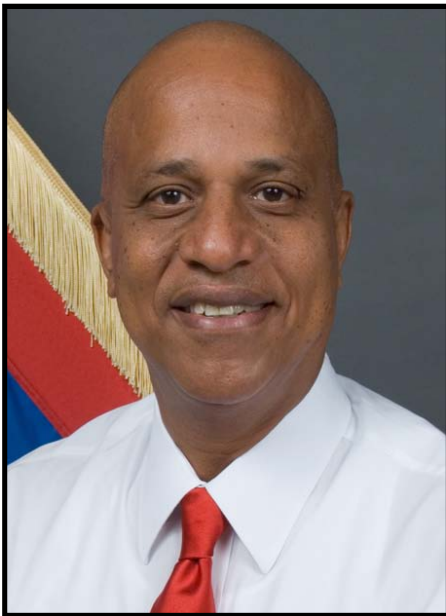
Prime Minister Dean Barrow

they were starting with a thing lately, every time they finish making their speech and going on about how things are bad, they would say, call the elections now. I notice you never said "call the elections now" this time.