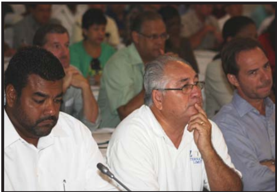
Attentive Businessmen during the P M's address