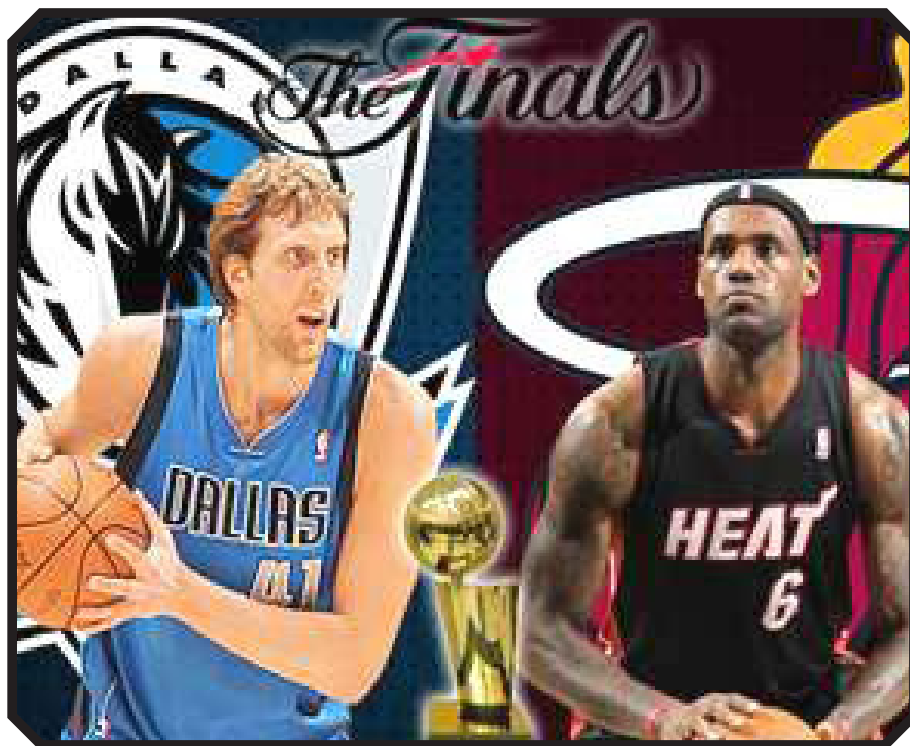
Dirk Nowitzki (Mavericks) and LeBron James (Miami) In the Last NBA Finals Earlier this Year

The National Basketball Association (NBA) and its players have reached a tentative deal on a new collective bargaining agreement which paves the way for a 66-game season starting on Christmas Day. Financial details of the plan were not released but NBA Commissioner David Stern said the settlement called for training camps and the league's free agency period to begin on December 9. "We've reached a tentative understanding that is subject to a variety of approvals and very complex machinations," Stern told a news conference early on Saturday after a 15-hour negotiating session. "But we're optimistic that will all come to pass and that the NBA season will begin on December 25, Christmas Day, with a triple-header. "We're very pleased that we've come this far. There's still a lot of work to be done in a lot of places, with a lot of committees and player groups and the like. "But we're optimistic that it will hold and we'll have ourselves an NBA season." Stern said the deal would be put before the owners' labor relations committee during a teleconference later on Saturday, before being passed on to the overall Board of Governors. Billy Hunter, the former executive director of the players' now-disbanded union, said: "We're going to turn it all over to the lawyers here and have them work out all the details." The players de-certified