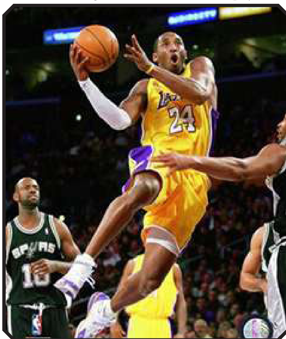
Kobe Bryant (L.A. Lakers), loved and hated by Basketball fans all over, including Belize

league had "literally thousands of people who are dependent upon the playing of our games at arenas, at parking lots, at restaurants around the stadium." "The reason for the settlement is (that) we've got fans, we've got players who would like to play, we've