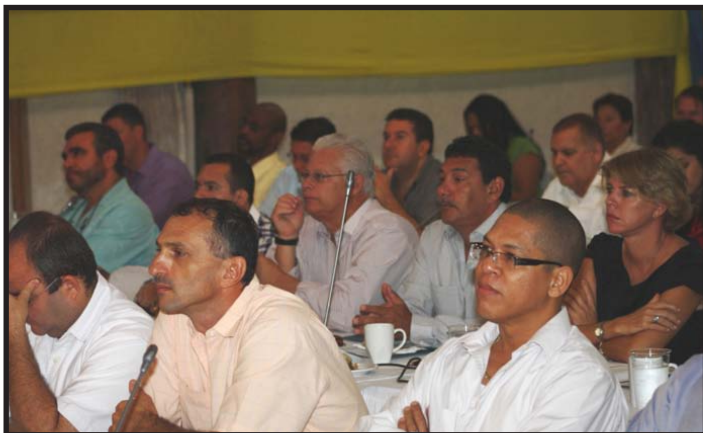
Members of Belize's Private Sector, Serious about Turning the Corner