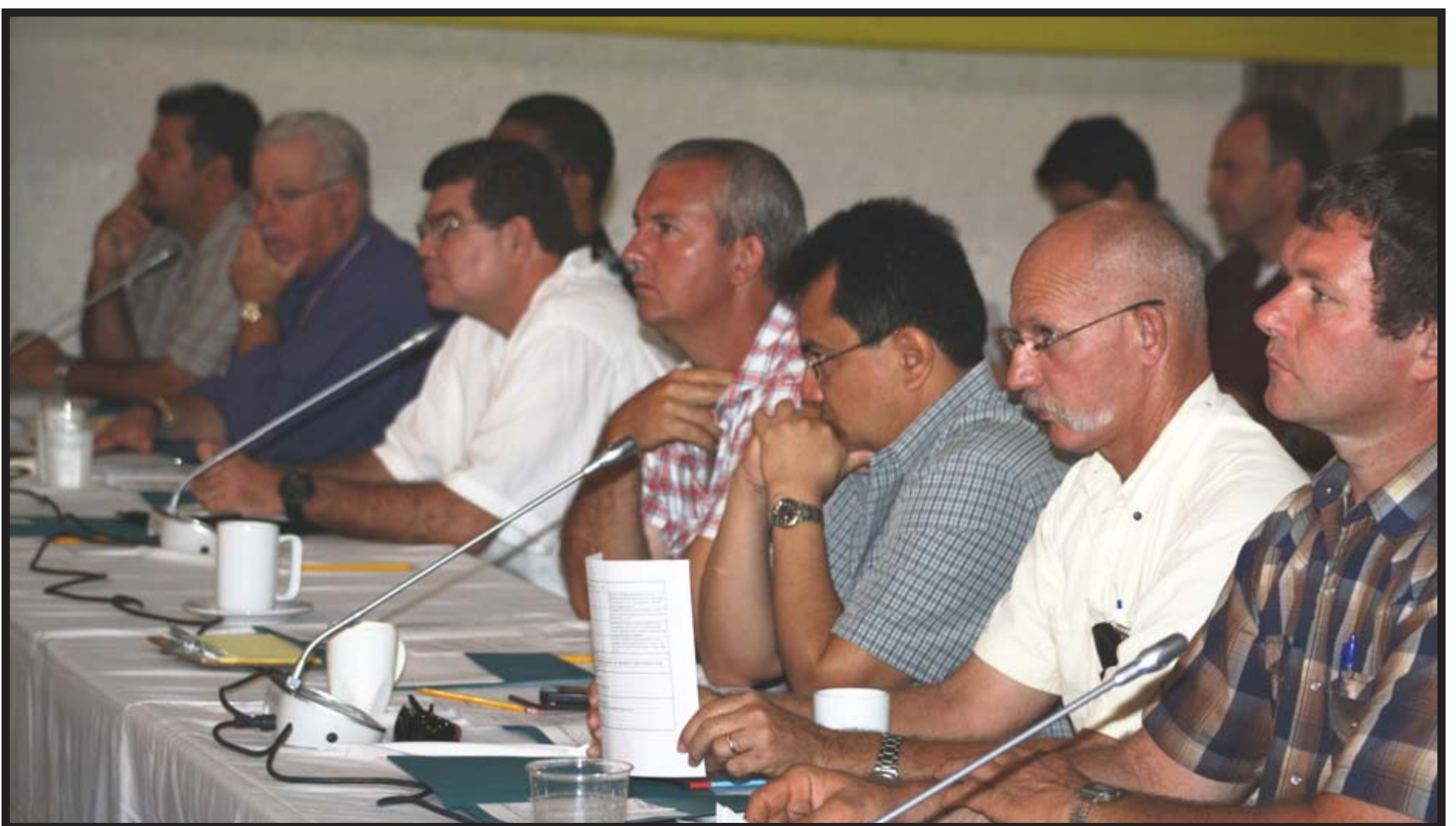
Members of the Private Sector attentively tuning in to Prime Minister's address