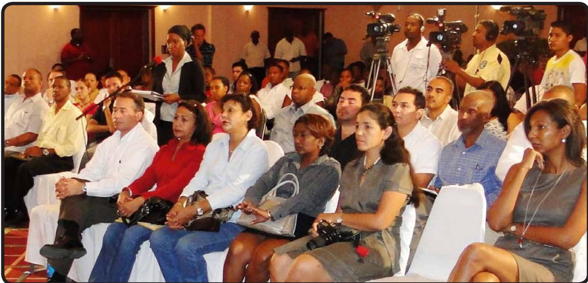
Members of the Local Media and Well-Wishers at Quarterly Press Conference