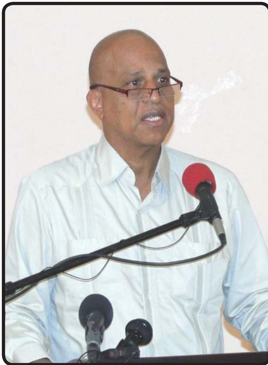
Prime Minister Dean Barrow

Now, clearly this exercise is an objective one and I can't presuppose, and I can't interfere with the discretion and authority of the Public Utilities Commission. But you don't have to be very bright to know that certainly would have insisted that the process be put in train if I did not feel very confident that, contrary to what Fortis was saying, this rate setting exercise can produce a lowering of