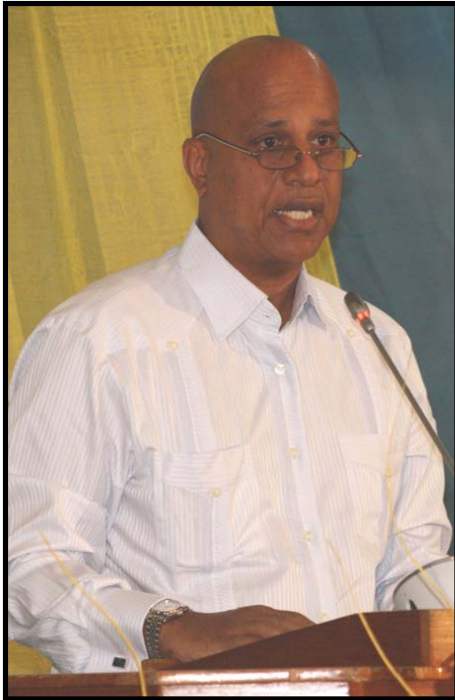
Prime Minister Dean Barrow

In setting the stage for this forum that is overdue, it is fair to say that no Government of Belize has before been put into a situation where so much of its time and resources have had to be spent, including in Court, to recover