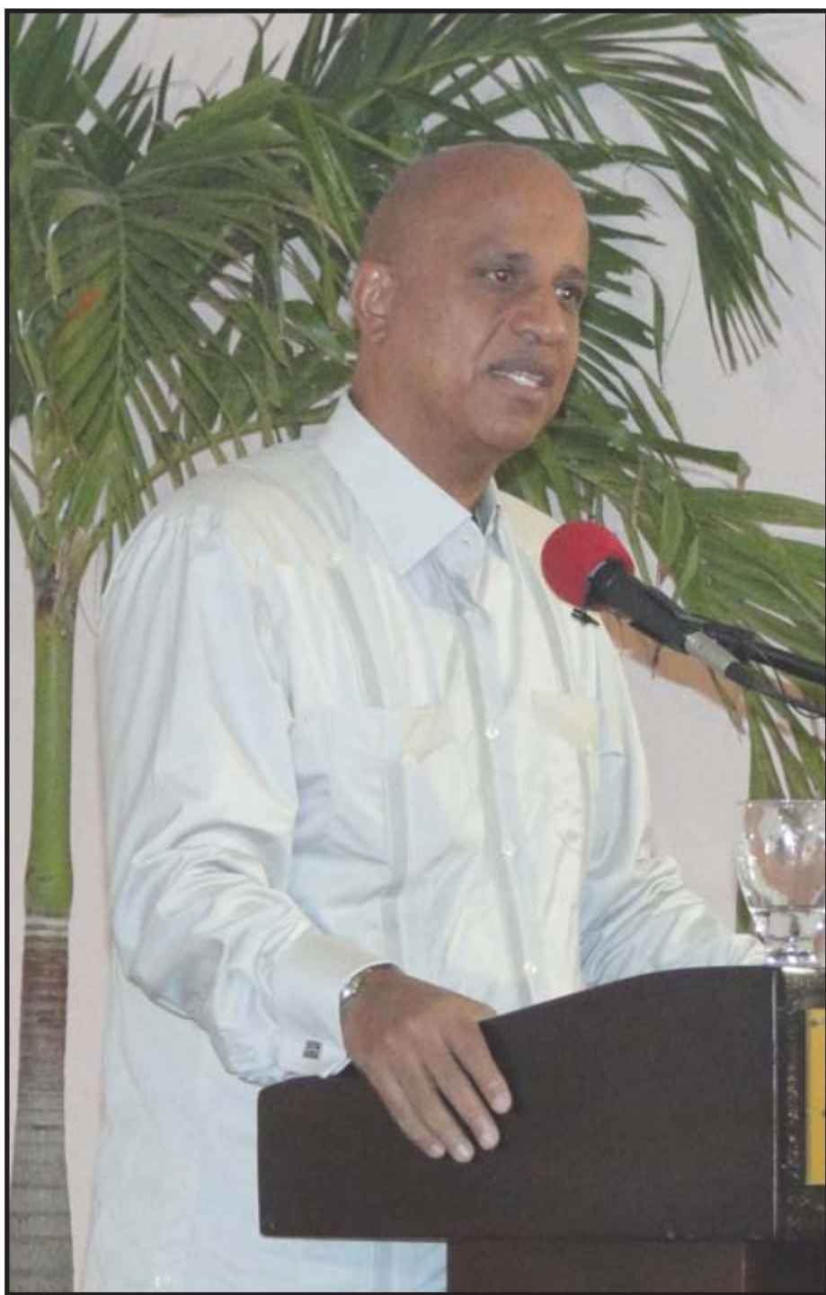
P. M. Barrow at his last Press Conference leaving the question of Early Elections hanging