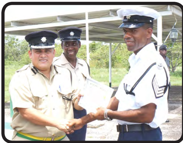
Officers who participated in the training receiving their certificates for successfully completing the Course