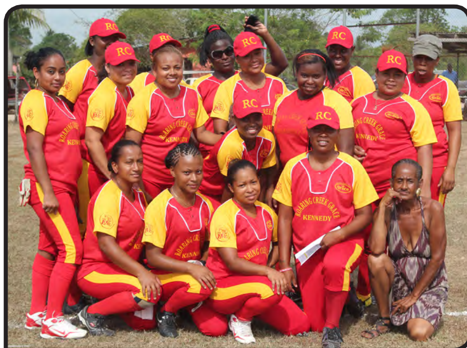
The Roaring Creek Grace Kennedy Girls