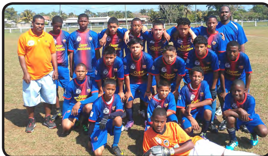
Barcelona - Site 7 - Championship Team Youth Cup

Belmopan City Council Youth All-stars = 04 vs Orange Walk Youth All-stars = 00