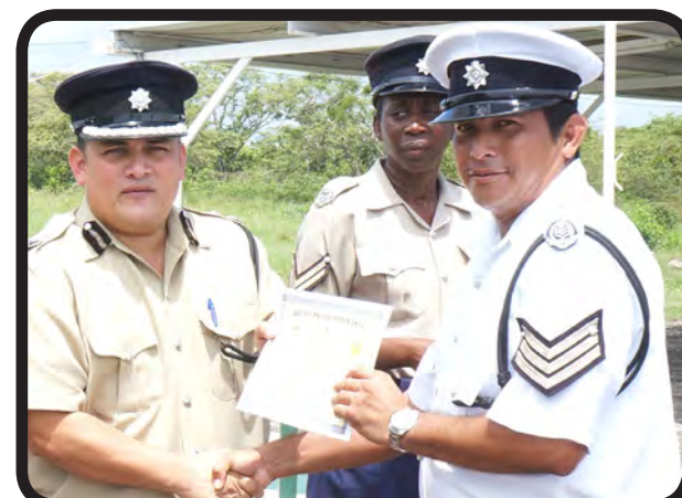
Officers who participated in the training receiving their certificates for successfully completing the Course