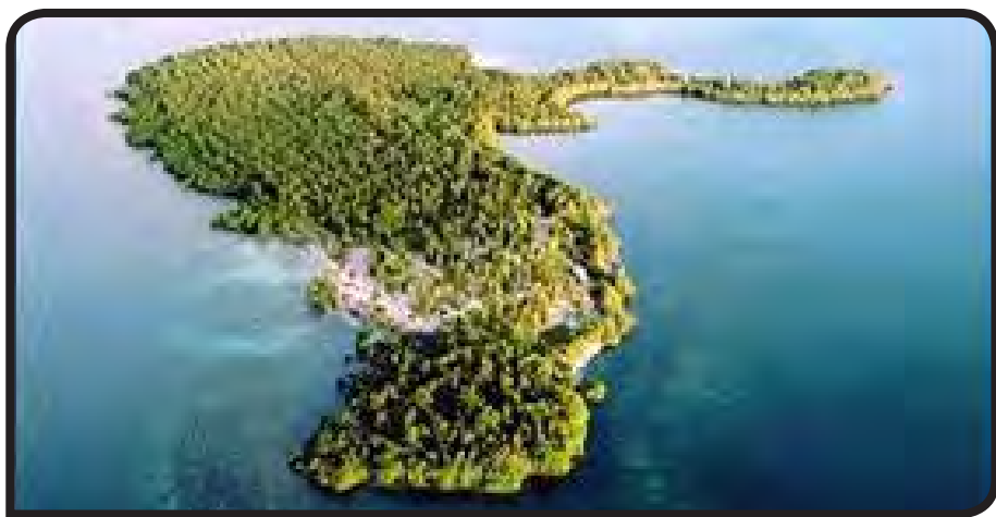
Aerial Photograph of Crawl Caye

W e doubt many of you caught it, but last week in our story titled, “The Case of the Crawl Caye Project - a Lesson in Transparency, Thoughtfulness and Thoroughness”, we mistakenly reproduced a photograph of Hunting Caye instead of Crawl Caye.