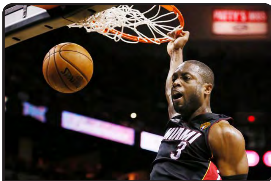
Dwyane Wade finally catches fire, finishing with 32 points as the Miami Heat even the series in Game Four of the NBA Finals

LeBron James was dominant on both ends, but in many ways the night belonged to Wade, the two-time champion who had been limited due to chronic knee problems. Wade looked to be the picture of health on Thursday, with a lively, athletic, throwback performance: 32 points, six rebounds, four assists and six steals.