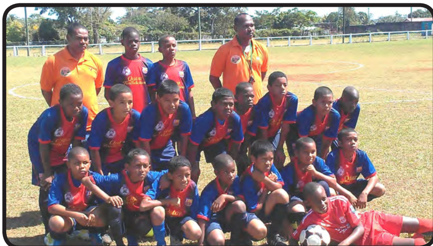
Barcelona - Site 7 - Championship Team Kids Cup