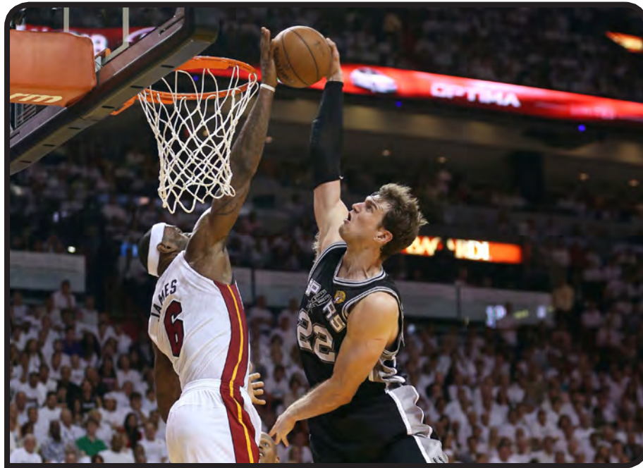
Miami Heat forward LeBron James blocks San Antonio Spurs Center Tiago Splitter at the basket during the fourth quarter of Game 2 of the 2013 NBA Finals at the American Airlines Arena in Miami on June 9

The way this series is going, the maximum number of games