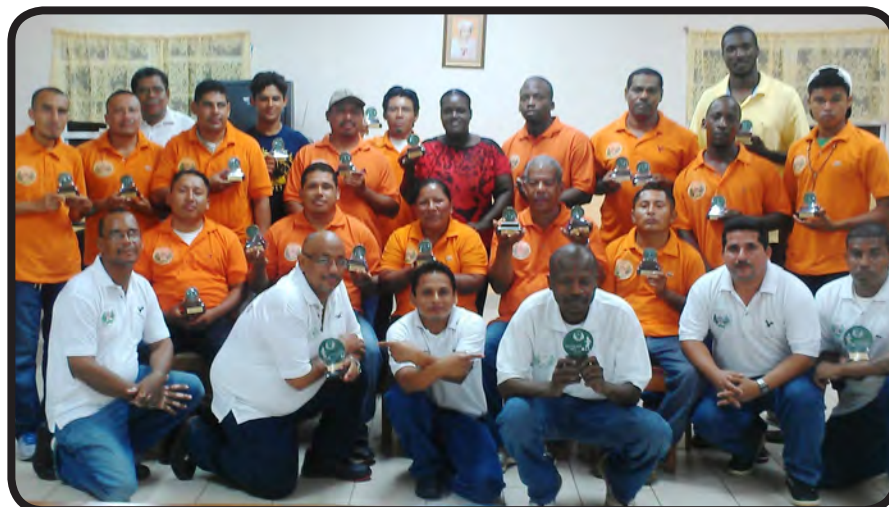
Belmopan City Council Kids & Youth Cup Coaches & Coordinators