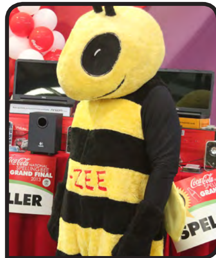
The Spelling Bee, Maskot of the Coca Cola Sponsored Contest

year, Bowen & Bowen Ltd., parent company of Coca-Cola in Belize, and the Ministry of Education hosted this educational competition. CEO and President of Bowen &