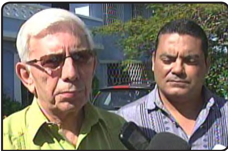
Said Musa and Francis Fonseca