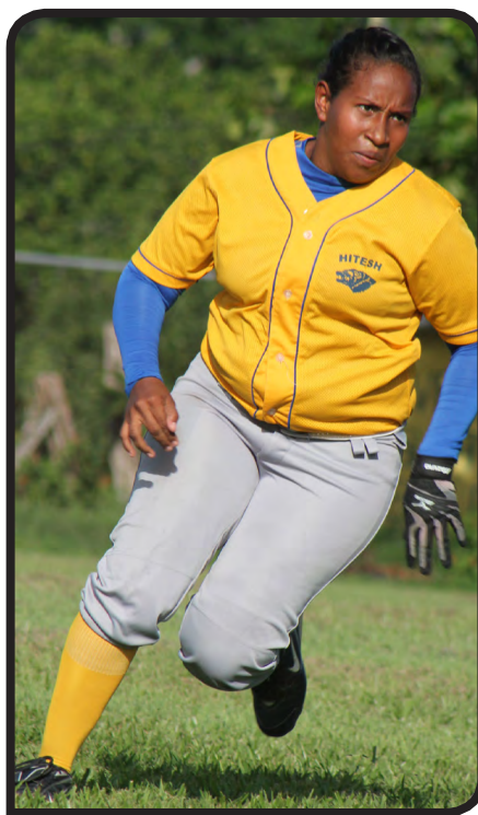
Indira Spain Esperanza Wolverines