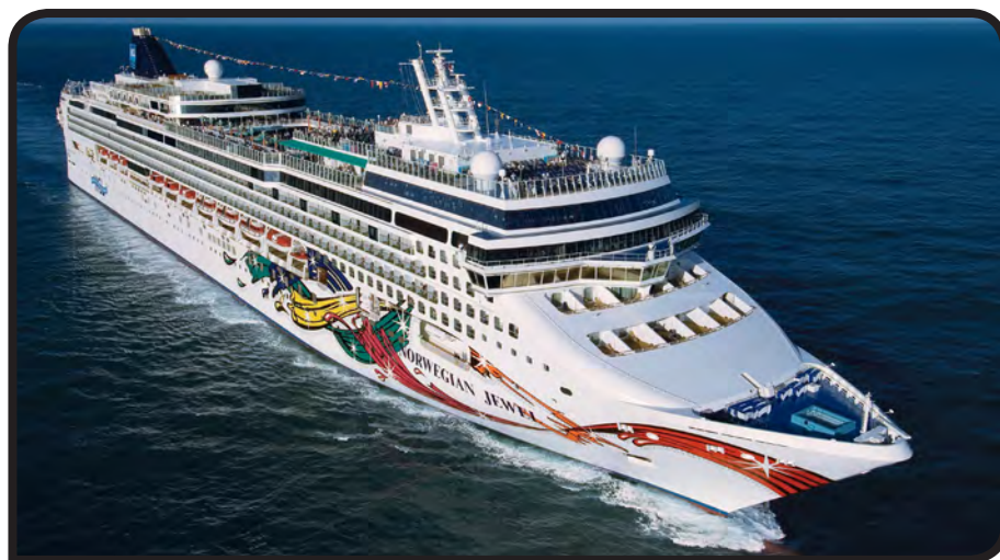
One of Norwegian Cruise Line’s Ships

I don’t know how there was ever a thought that if a project takes place in the South that it would divert traffic from Belize City; that cannot be a concern because we made clear to NCL, even at the start of the discussion, that if the project were ever to see the light of day, the site would be limited to hosting calls only from ships from NCL; no other line would be able to go there; so there was never any question of a conflict between the interests of the Belize City people and the people in the South.”