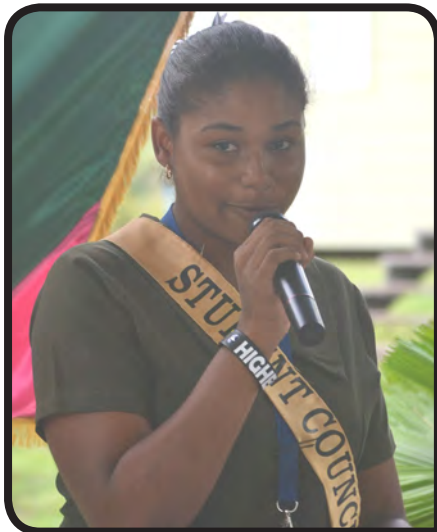
One of the thankful students to benefit from the generous gift