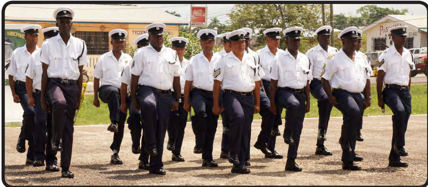
Participants demonstrating one of the drills they re-sharpened through the Training Course