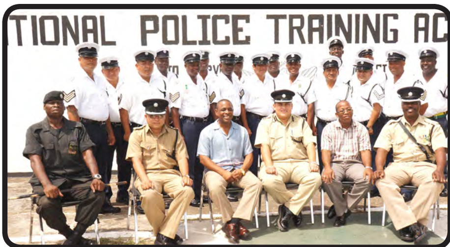
The Participants with Instructor and Senior Officers seated in front