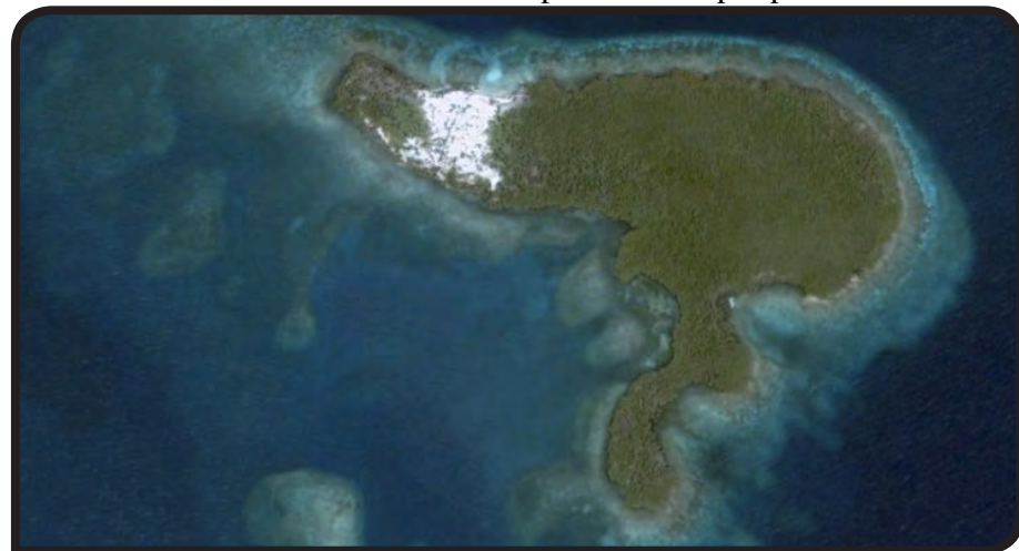
Satellite View of Crawl Caye

When asked what was the position of Norwegian Cruise Lines now that the considered response by the government was a no-go, Hon. Godwin Hulse stated, “Well they will continue to look and see what is possible, but our view is that in any of these situations we should work with