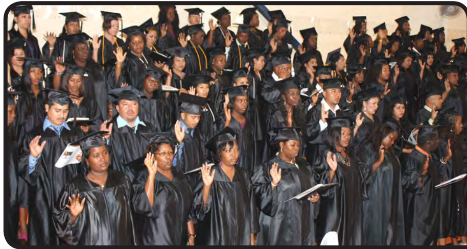
One of UB's past graduations, two and a half years ago in early 2011

The largest number of graduates are from the Faculty of Management & Social Sciences (FMSS) totalling 153, followed by the Faculty of Education and Arts (FEA) with a total of