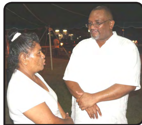
A Resident discussing personal concerns