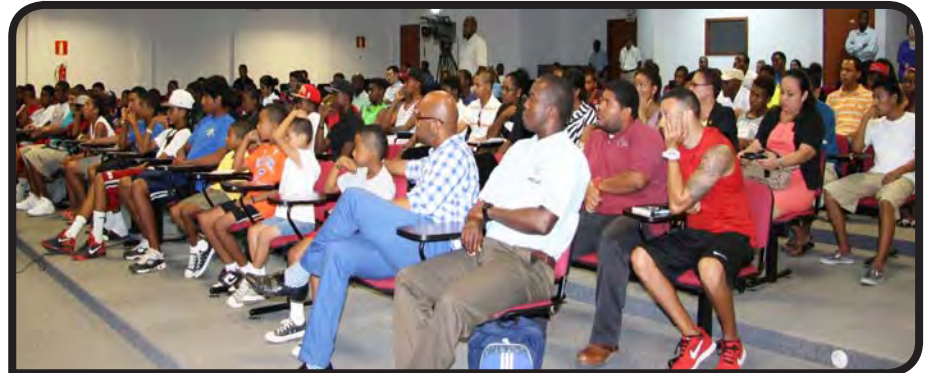
A packed auditorium at the University of Belize in Belmopan