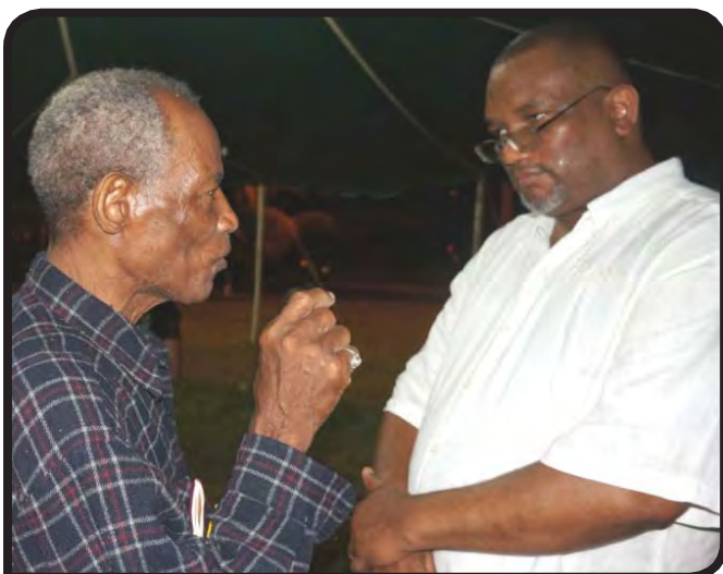
A Resident discusses personal concerns