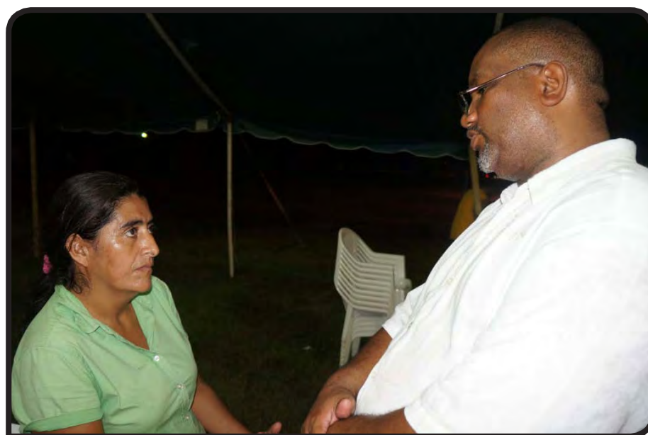
A Mother from the Belmopan area discusses her issues of concern with her Area Rep, Hon. Saldivar, following the neighbourhood meeting