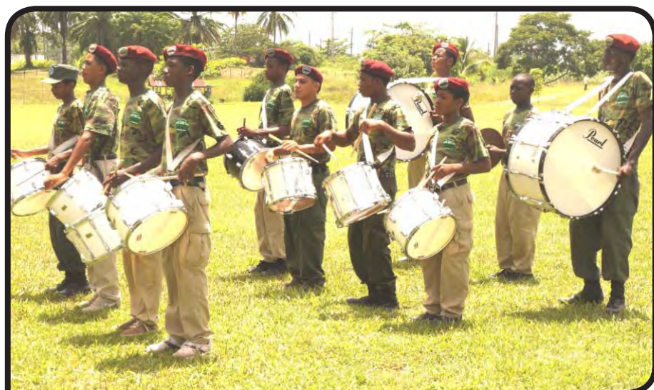
The BDF Youth Cadet Corps Marching Band