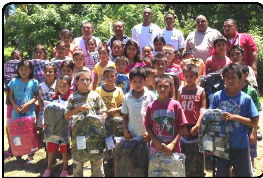
Representatives of the National Football Selection along with community leaders and students in the Village of Bullet Tree Falls

Recently the Belize National Football Team has been receiving generously from the Belizean population, but on Wednesday, July 31 they gave back a little.