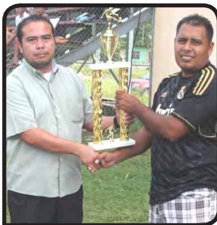
Player for San Martin Aguilas Receives First Place Trophy