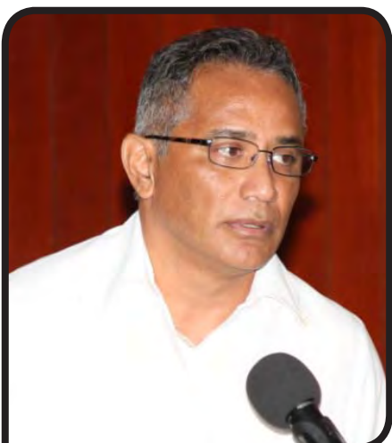
Hon. Johnny Briceno

Where is your motion that you are to present today, your motion to deal with the failing education system, where is your motion to deal with the crisis in health, where is the motion apologizing to the fathers and mothers of the 13 babies who died at Karl Heusner? Bring a motion to the House for that! There is no question that