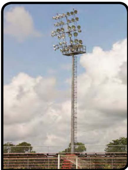
One of the sets of lights at the FFB Stadium being upgraded

In a Press Release, the F.F.B says it will keep the pub-