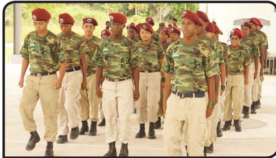
Young Cadets demonstrating their drills during the Minister's visit

The BDF Youth Cadet Corps has nationwide memberships, and the annual camp is moved from district to district each year, being hosted by the