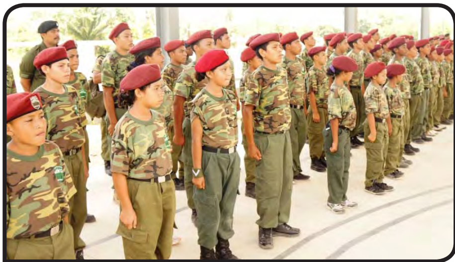
Young Cadets demonstrating their drills during the Minister's visit

National Security Minister visits BDF Youth Cadet Corp Summer Camp