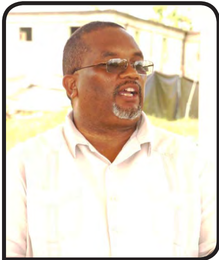
Hon. John Saldivar addressing the cadets at the end of the visit

National Security Minister visits BDF Youth Cadet Corp Summer Camp