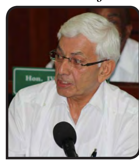
Hon. Said Musa