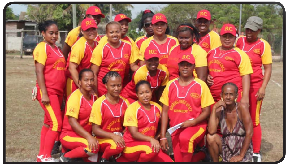
The Roaring Creek Team that is going to the Finals

The San Martin Aguilas bombed Roaring Creek: 2-0 to win the Cayo 1 st Division football Championship at the FFB Stadium in Belmopan on Sunday afternoon, August 4.