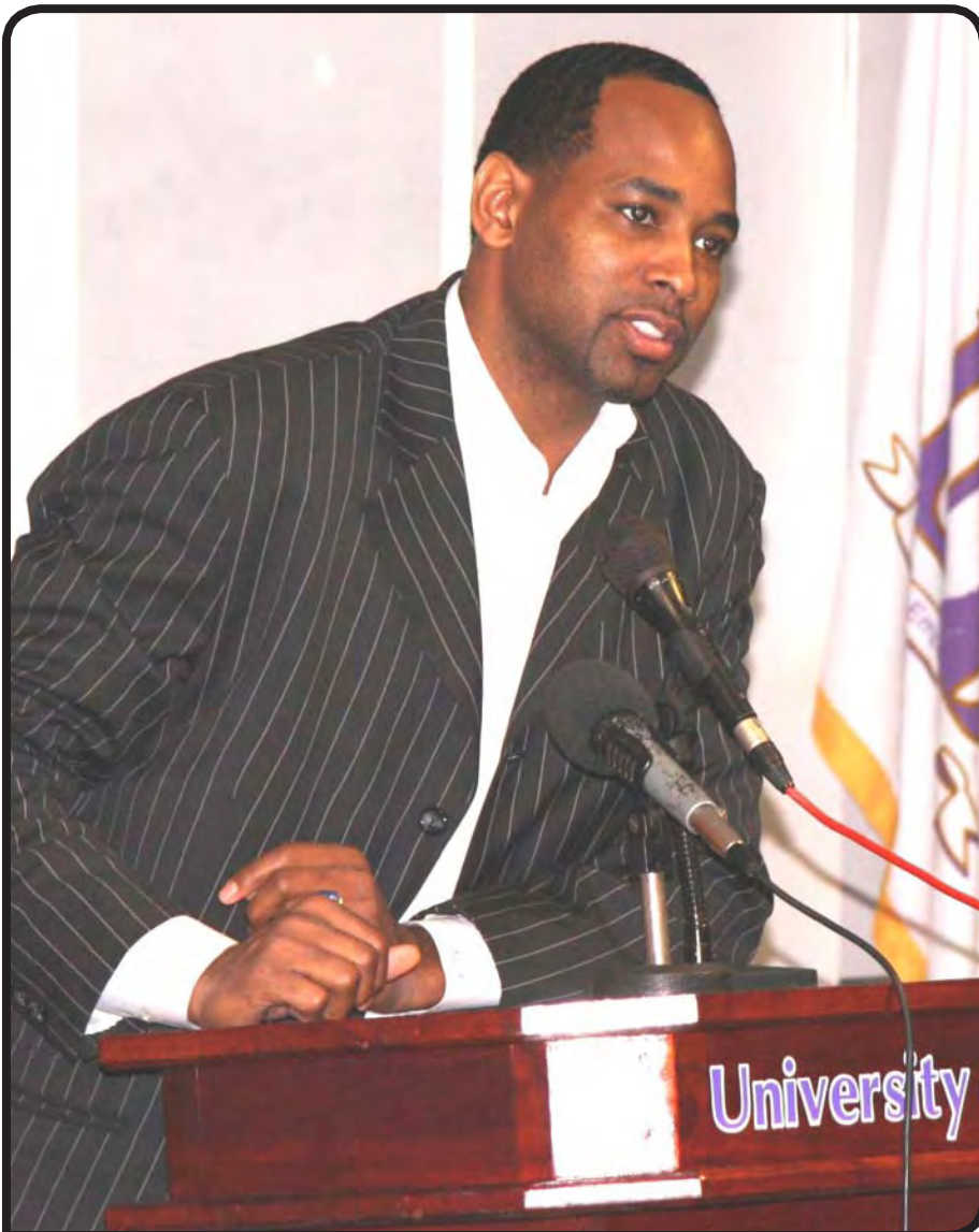
Visiting NBA player Derek Anderson delivers Motivational Speech on Entrepreneurship at the University of Belize Auditorium

Derek Anderson Delivers Motivational Talk at UB in Belmopan