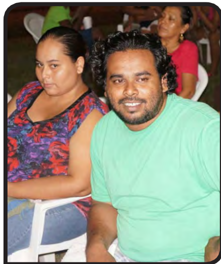
Residents raising issues, sharing views and asking questions

nity Center. The Salvapan/San Martin Zone had its neighborhood meeting on Friday August 2, 2013 at the San Martin Government School. And the round of neighborhood meetings wrapped up with the Maya Mopan/San Martin Zone, which had its meeting on Monday Au-