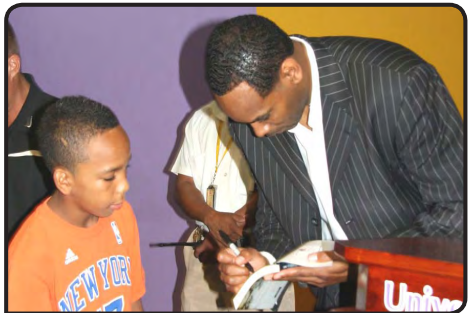
Derek Anderson signs copy of his Book, Stamina, for a young Belizean