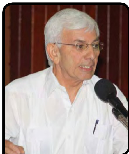
Hon. Said Musa

But all that was just wishful thinking on the Opposition's part, a last ditch effort to save some face, as the "misconceived" motion fell flat on its face on the floor of the National Assembly."