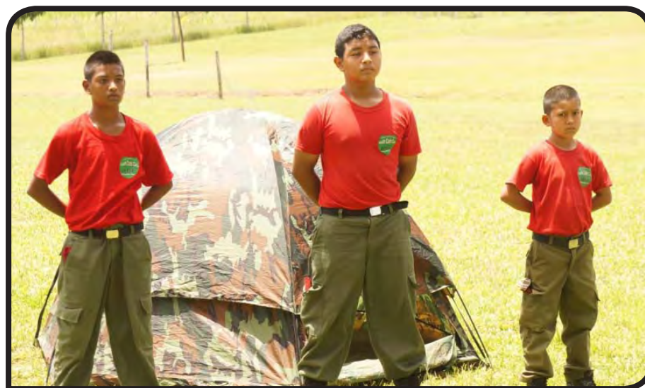
A group of Cadets Demonstrating their tent-making abilities