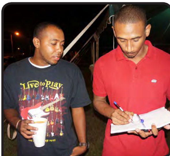
The Minister's assistant documents concerns