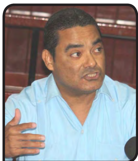
Hon. Francis Fonseca