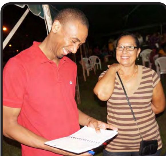
The Minister's assistant documents concerns following the neighbourhood meeting