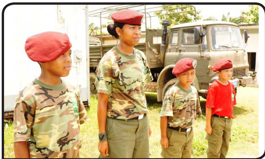
A group of Young Cadets meeting the Minister and BDF commanders

respective company. In 2008, it was hosted in Corozal by Toucan Company; 2009 in Belmopan by Black Orchid Company; 2010 Stann Creek District by Mahogany Company Detach-