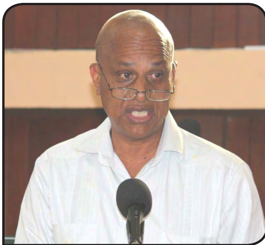
Prime Minister Hon. Dean Barrow in the National Assembly

As was expected, Musa and Fonseca took quite a beating on the issue, even as they attempted to fight back, try-