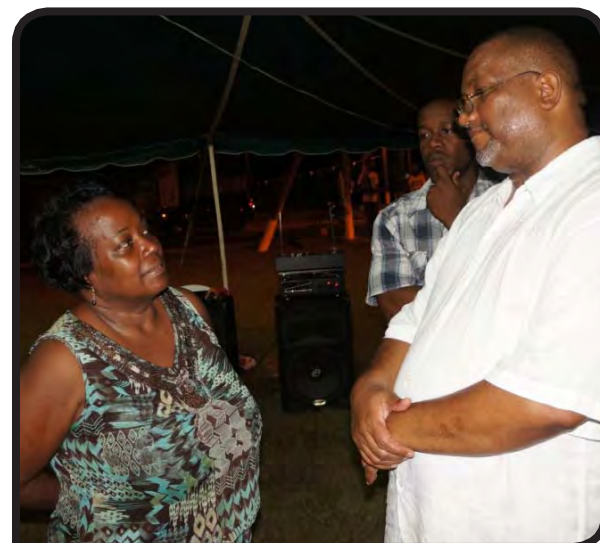
A Resident discusses personal concerns