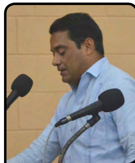
Hon. Francis Fonseca