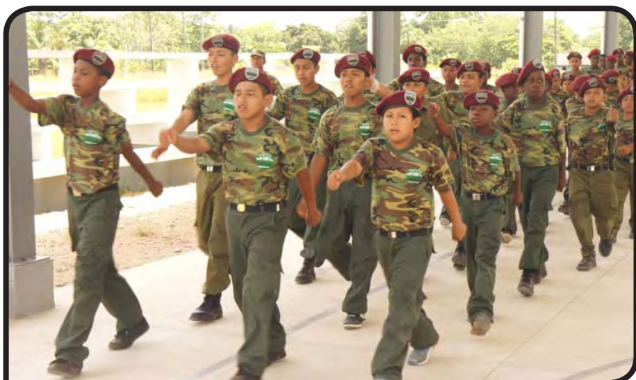
Young Cadets marching off following the Minister's visit