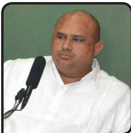
Speaker of the House Hon. Michael Peyrefitte

The whole purpose of bringing forward this motion is to take away attention from the fact that as chairman of the public accounts committee, he has not been doing his job."