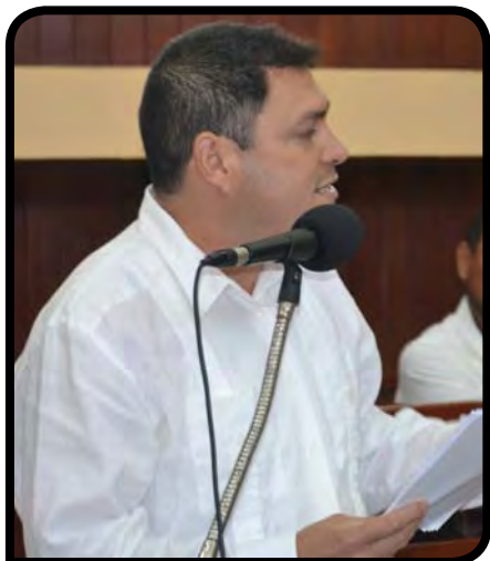
Hon. Julius Espot

H e had created quite a stir in the local media about his intentions to introduce a motion in the National Assembly to alter the composition of the Public Accounts Committee which he presently chairs as a member of the Opposition.