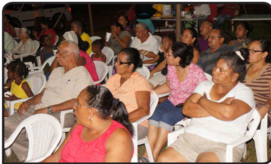
Residents who attended the Neighbourhood Meeting for the Central Zone held at the Sir Gorge Brown Field

The other five zones are Belmopan North; Belmopan South; Las Flores; Salvapan/San Martin and Maya Mopan/San Martin. Each of the six zones in the constituency has its own neighborhood meeting that is scheduled for every quarter or so (every three months).