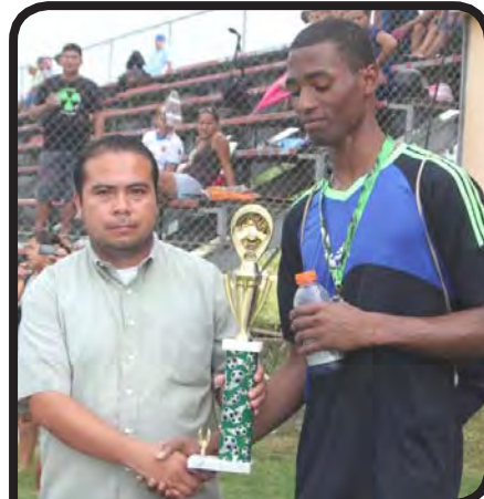
Player for Roaring Creek Receives Second Place Trophy