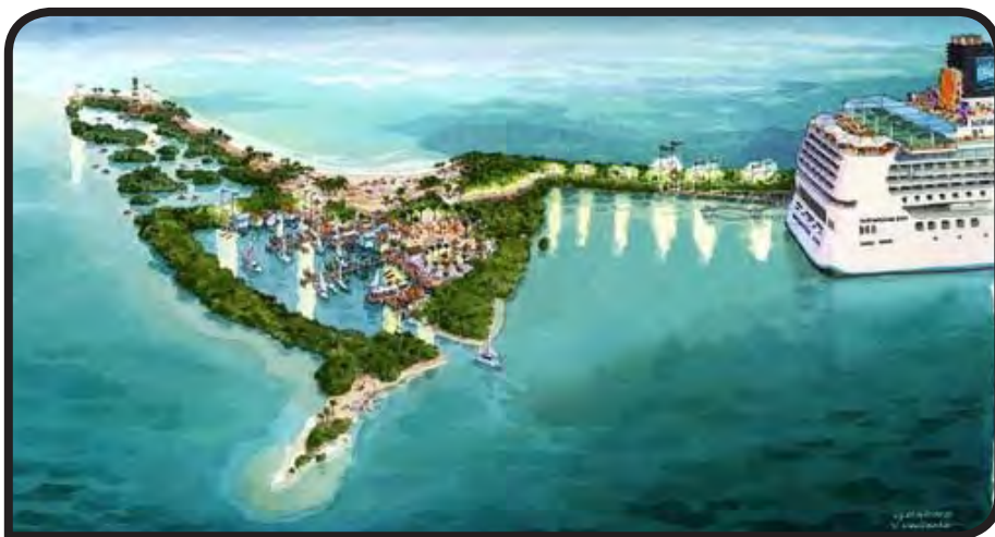
Rendering of Norwegian Cruise Line's port project, which it plans to develop on Harvest Caye that it has purchased in Southern Belize

the project are anticipated to include a floating pier, island village with open-air structures on raised platforms, marina, transportation hub for tours to the mainland, a lagoon for a variety of water sports and a relaxing beach area. The goal is to design