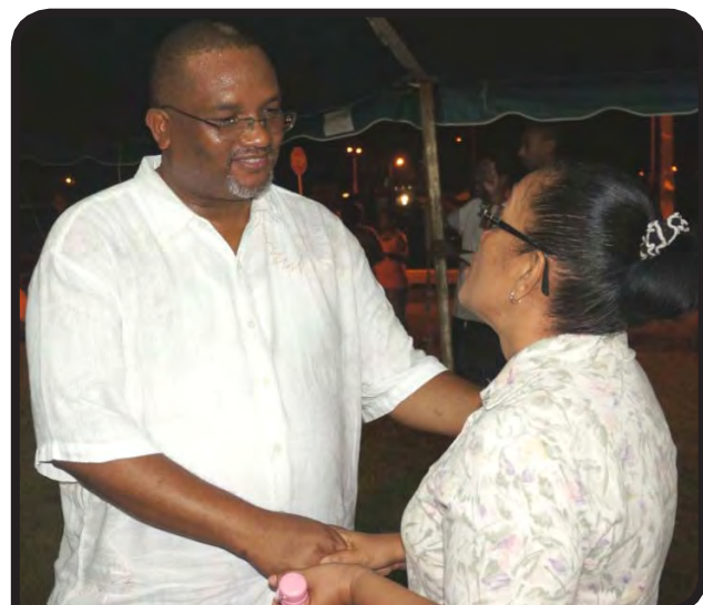
A Mother discusses her issues of concern following the neighbourhood meeting