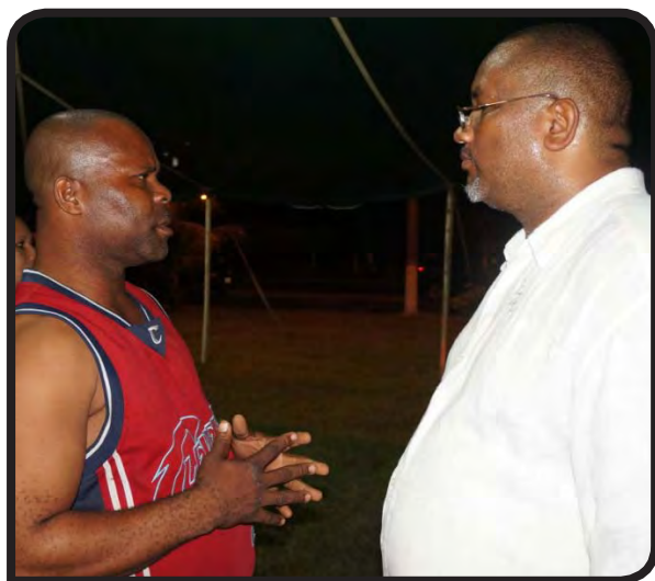
A Resident discussing personal concerns