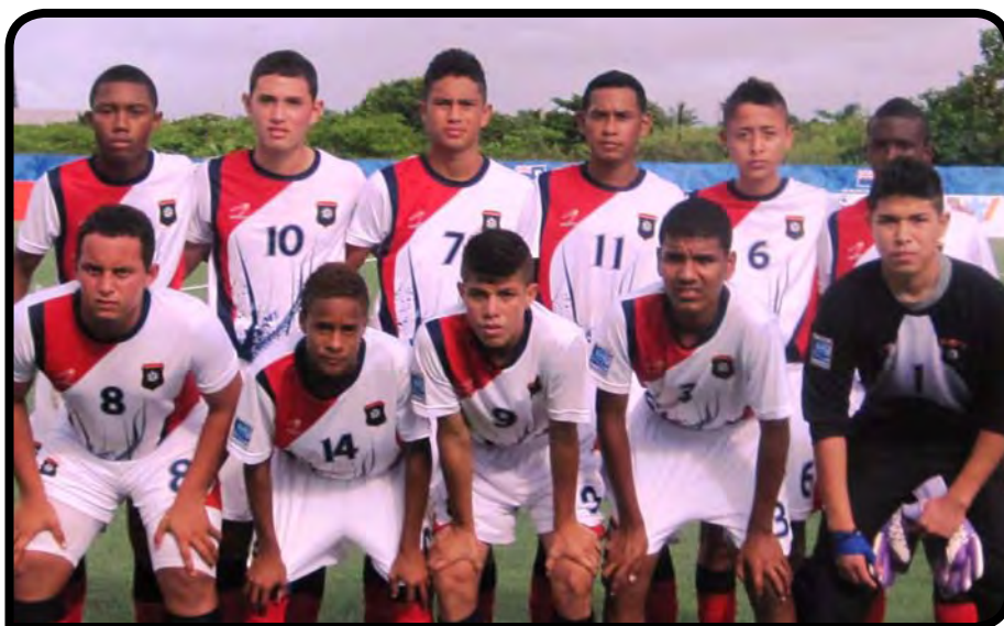
Members of the U-15 Belize selection that is in Grand Cayman