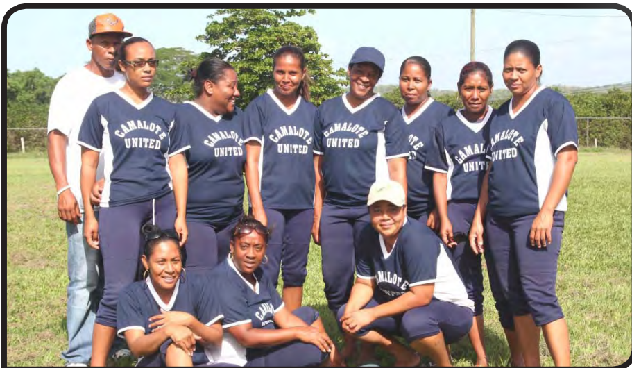
The Camalote Team that is going to the Finals

Camalote Blazaers had left 5 runners on base, but they made only 2 errors. The Ontario Rebels left 7 runners on base.