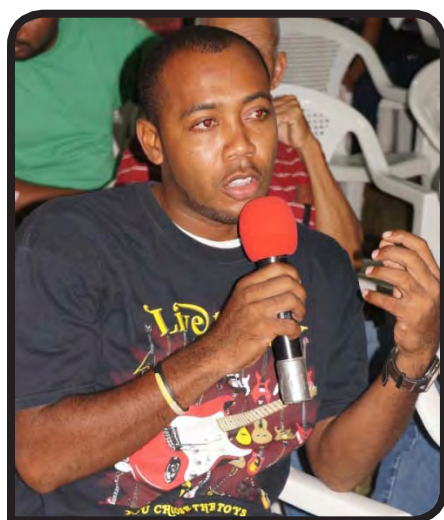
Residents raising issues, sharing their views and asking questions at the neighbourhood meeting

It is a very effective way of staying in touch with the people, keeping them informed about ongoing developments, about the work of their Government and Area Representative, and to hear and address their concerns and issues. Following