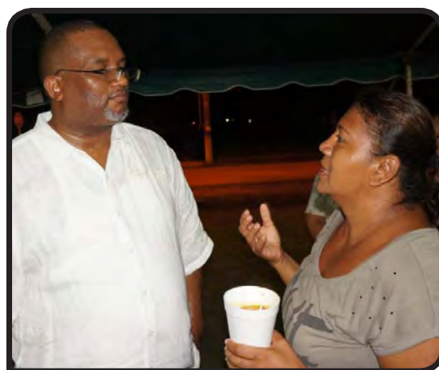
A Mother discusses her issues of concern following the neighbourhood meeting