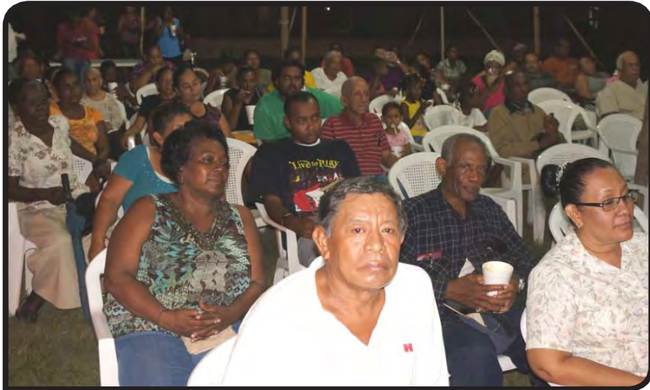
Residents who attended the Neighbourhood Meeting for the Central Zone held at the Sir Gorge Brown Field

The next round of neighborhood meetings is tentatively scheduled for November of this year. Residents of Belmopan, particularly those residing in these particular areas are invited to come out and participate.