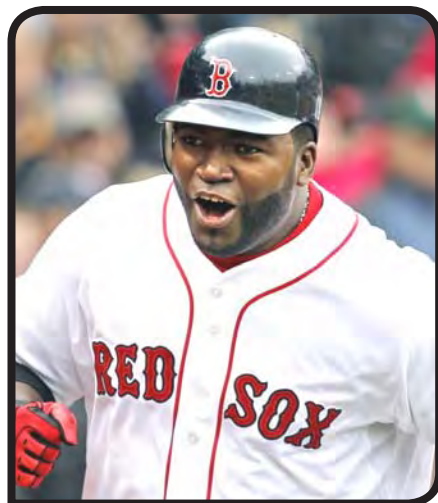
David Ortiz of Boston Red Sox

Put them in the World Series, and you'd get arguably MLB's best pitching staff (Dodgers) going up against unquestionably MLB's best offensive club (Red Sox). But since the Dodgers can also hit a little bit and the Red Sox can also pitch a little bit, it's hardly out of the question that a series between the two would need the full allotment of seven games. That would make an already-attractive match-