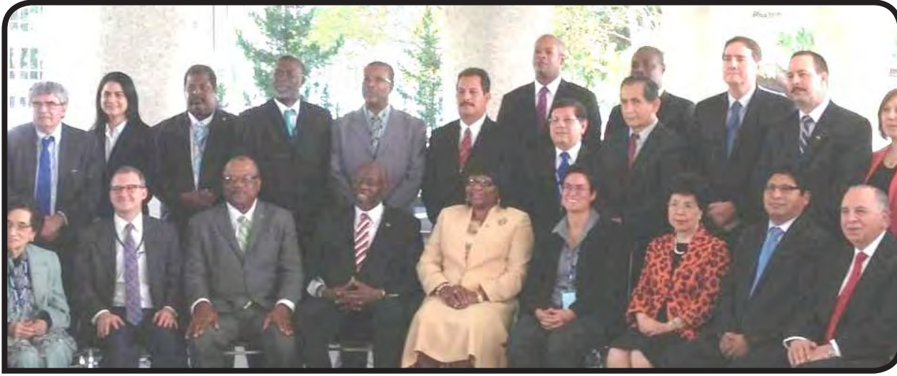
Belize's Minister of Health. Honorable Pablo Marin among Health officials from other nations who attended the countries the delegates from at the Council in Washington