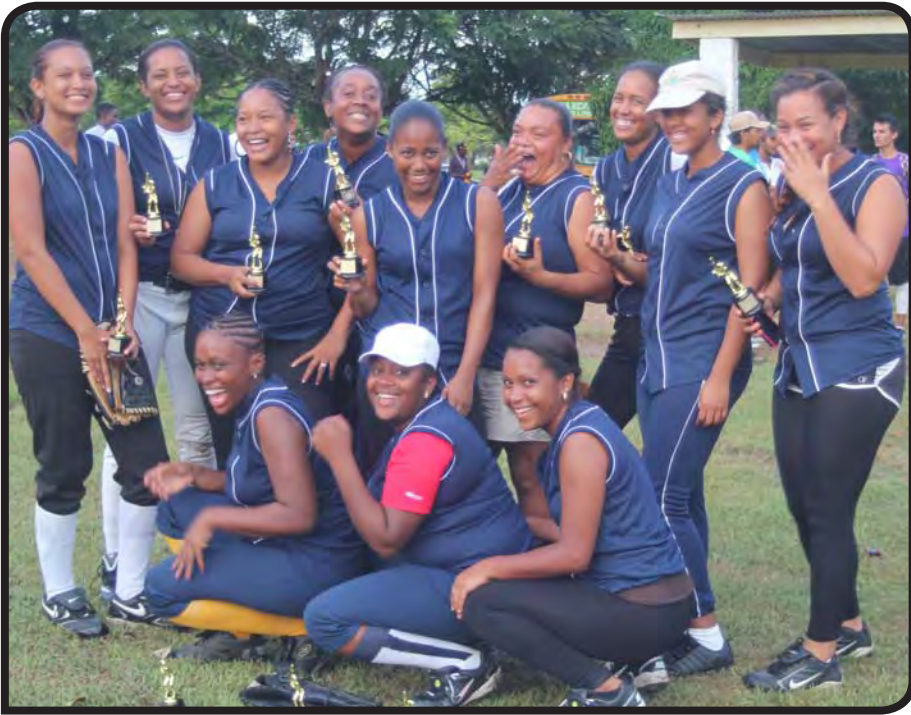
The Lady Jaguars Softball Team of the University of Belize