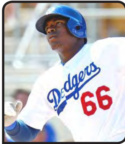
Yasiel Puig of L.A. Dodgers

up even more attractive. After all, the last time a Game 7 was played in the World Series was in 2011, and it was the top-rat-