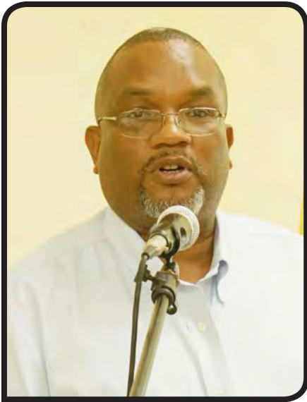
Hon. John Saldivar Minister of National Security

Minister of National Security Hon. John Saldivar on Wednesday, October 9, presented his Monthly Awards for the zone and formation that performed the best in reducing major crimes during the month of September, 2013.