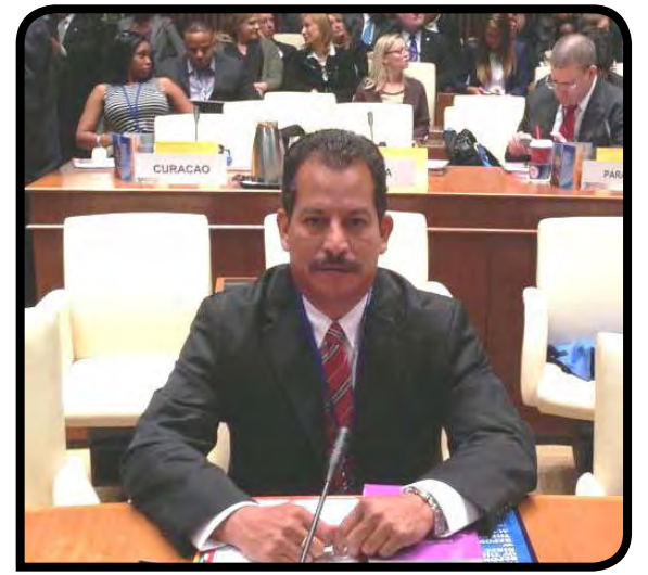
Belize's Minister of Health. Hon. Pablo Marin at the Conference in Washington

M inister of Health Hon. Pablo Marin was among health officials that agreed to a plan of action that seeks to reduce premature deaths due to non-communicable diseases (NCDs) by 25% by the year 2025. The joint plan of action was approved by the 52nd Directing Council of the Pan American Health Organiza-