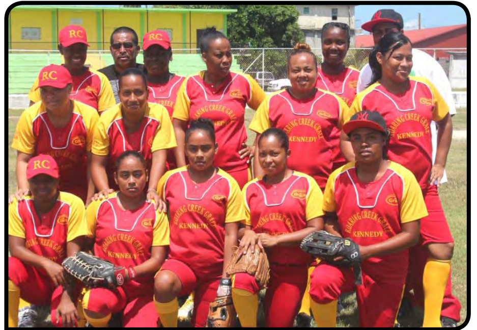
Second Place - Roaring Creek Grace Kennedy

B elize Telemedia repeated as back to back national champs while Roaring Creek Grace Kennedy placed 2nd when the Belize Softball Federation held its 14th National Women's Softball Championship at the home of softball at the Roger's Stadium in Belize City on Sunday, September 29.