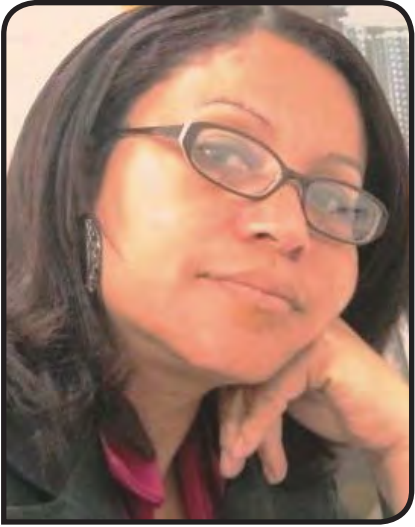
By Zelda Hill

Once upon a time, an aspiring, young and desperate nation was in deep trouble. Her people had been mistreated and enslaved and then, just when they thought it could not get worse, they found themselves wandering aimlessly in the hostile wilderness. They and their children were disgruntled and weary and they needed rest; a place that they could proudly call home.