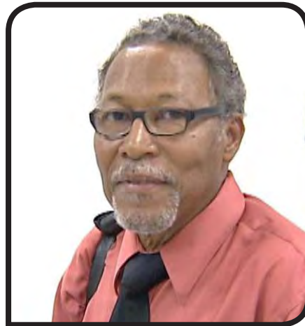
Hon. Godwin Hulse The Substantive Minister of Immigration and Nationality

national criminal who has never set foot in Belize, is costing not just the disgraced Minister of State, but the Substantive Minister and, indeed, the entire government an enormous amount of time and energy that could be better spent carrying out its development agenda. Ever since the story broke three weeks ago, the dominant news story on every newscast, radio and televi-