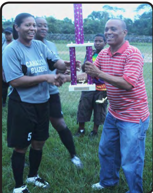
Camalote Blazers 2013 Champs