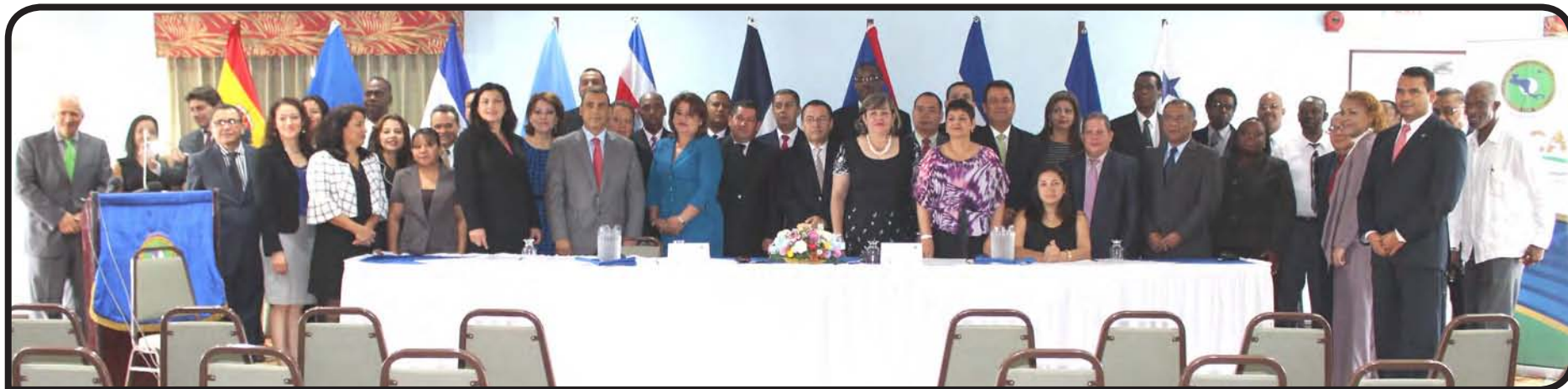
All the Judges and Judicial Officers from all the Countries participating in the SICA Sponsored Conference

M oney Laundering and Drug Trafficking were the main issues discussed at a meeting of judges and judicial officers from Central American nations convened this past Monday, October 7 in Belize City.