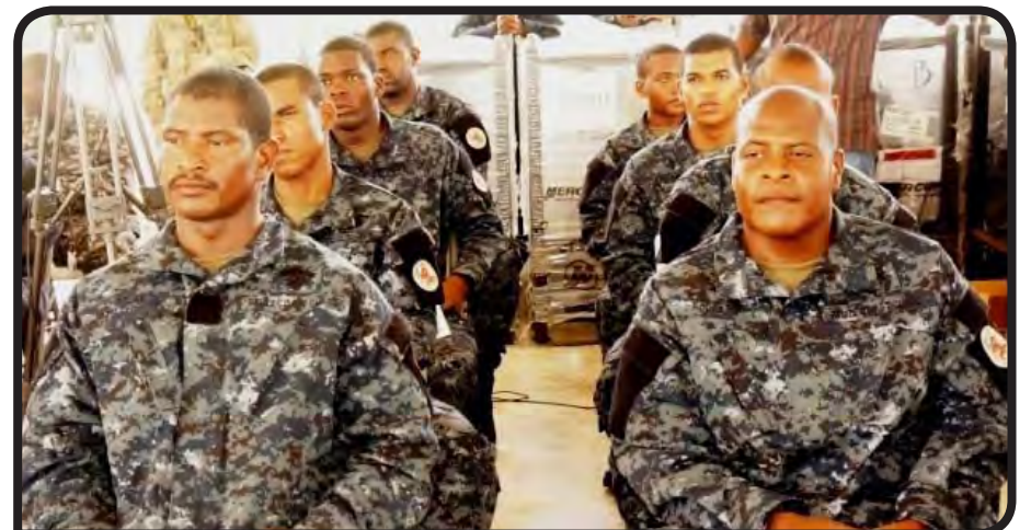
The Crazy 8 - Belize Coastguard SEAL Team 001