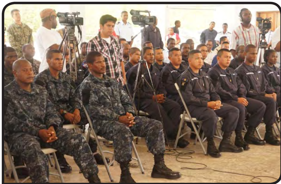
Members of Belize Coastguard SEAL Team 001 and other Officers who received Training in Special Warfare Operations