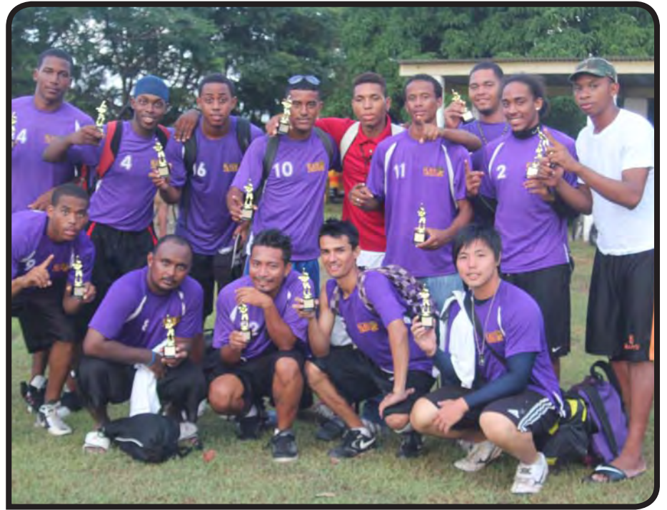
The jaguars Male Softball Team of the University of Belize

The University of Belize women won the National Softball Championship tournament organized by the Association of Tertiary level Institutions of Belize (ATLIB) at the Governor General's field in Belmopan on Saturday, October 5.