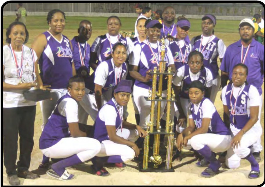
National Softball Champions 2013 - Belize Telemedia