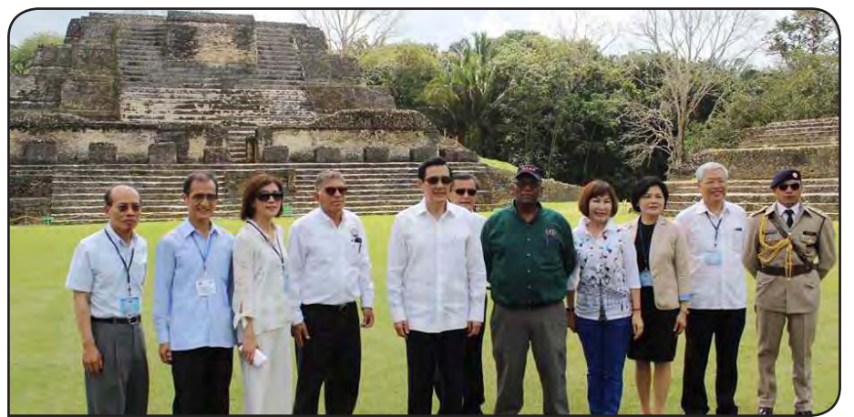
President Ma and entourage visit Ancient Mayan Temple

H e first visited Belize back in 2009, one year into his presidency and the first term of the Dean Barrow Administration which both started in 2008; and President Ma Ying-jeou of Taiwan was back in Belize from March 16 to 17, 2016 as part as his farewell tour.