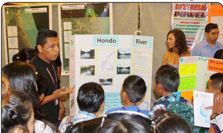
Facilitators Sharing with Students Vital Information about Water

about water related issues, be inspired to tell others and take action to make a difference. Each year, UN-Water — the entity that coordinates the UN's work on water and sanitation — sets a theme for World Water Day corresponding to a current or future challenge. The engagement campaign is coordinated by one or several of the UN-Water Members with a related mandate.