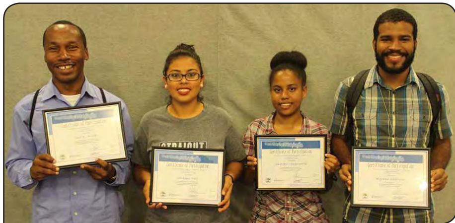
Awards received by First, Second, Third and Fourth Place Winners of the World Water Day 2016 Poetry Competition