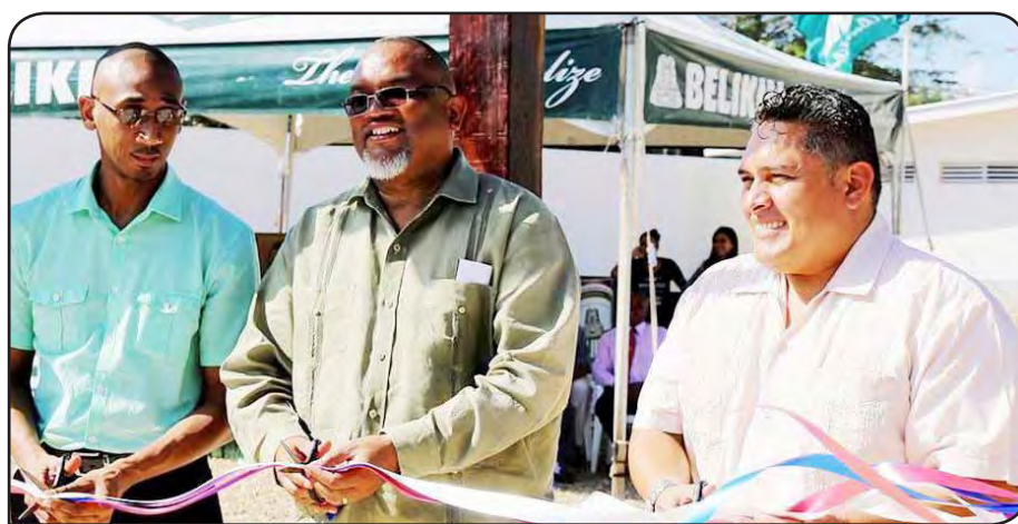
Belmopan Mayor Khalid Belisle, Area Rep. Hon. John Saldivar and Minister of State for Sports Hon. Elodio Aragon Cut Symbolic Ribbon