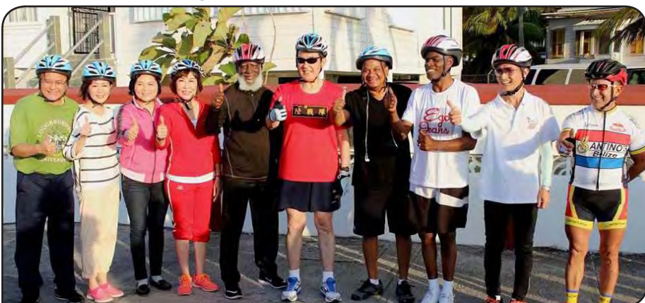
President Ma on bicycle tour accompanied by Government Ministers

egation at the airport. Once again, I wish to convey our sincerest thanks."