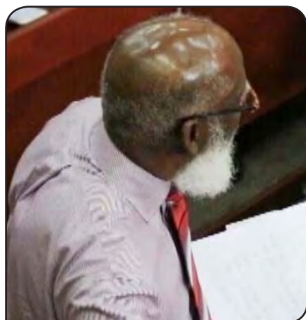
Hon. Wilfred Elrington Minister of Foreign Affairs

Belmopan Area Representative and aspiring UDP Deputy Leader Hon. John Saldivar remarked, "I want to thank the Leader of the Opposition for the about-face that he has made; and notice I'm saying 'he'; I am not saying 'his party'. I am thanking you, Sir, for the about-face that you have made about the Guatemala issue. Thank you; but I don't know, I did not hear any applause from your colleagues when you said so. I have to wonder if that is the view of your party."