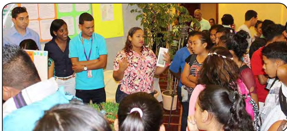
Facilitators Sharing with Students Vital Information about Water

World Water Day is an international observance and an opportunity to learn more