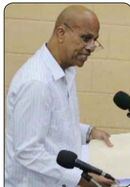
Right Honourable Dean Barrow Prime Minister of Belize Wrapping Up the Budget Debate

Mr. Speaker, that's why we put representatives of the National Trade Union Congress of Belize and the Chamber of Commerce on the BIL board of directors, to make absolutely sure of transparency, to guard completely against any possibility of HP, as your station called it, "hanky-panky." And those repre-