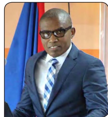
One of the Facilitators at the Regional Meeting in Belize City

During the meeting, countries discussed and agreed on how to create result-based road-maps to accelerate reforms and help track the implementation of actions linked to these reforms in the