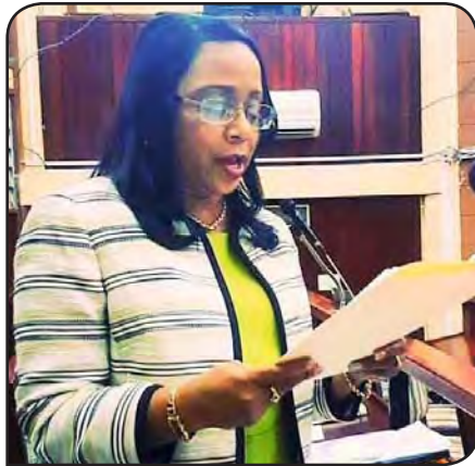
Honourable Beverly Castillo Belize Rural Central Rep.

management of our public monies. This is a government that makes and keeps its promises."