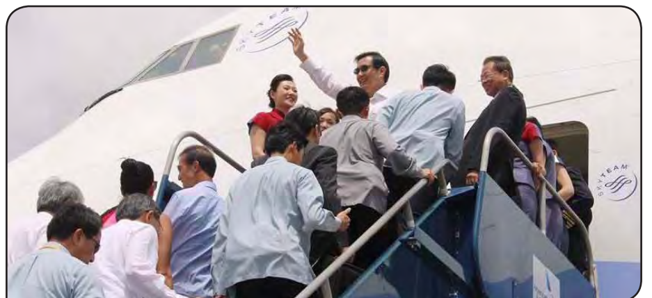
President Ma at the Phillip Goldson International Airport