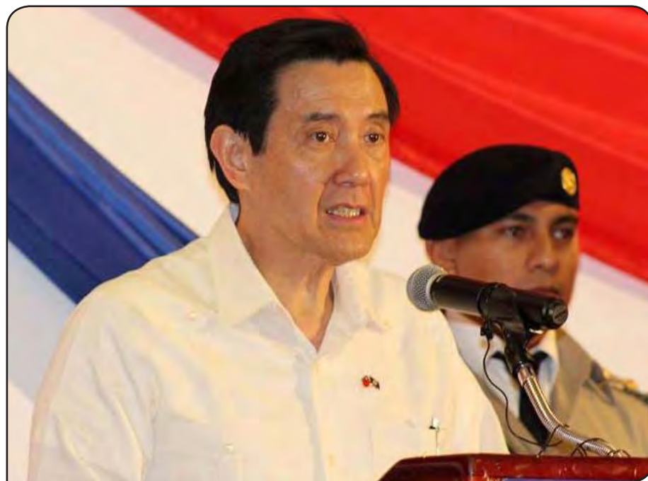
President Ma making address at Belize Biltmore Hotel

President Ma left Belize around 11:00 AM on Thursday, March 17, 2016. President Ma Ying-jeou leaves office in the next month-and-a-half, to be succeeded by Taiwan's first female president, who will be sworn into office on May 20, 2016. During his time as President, President Ma was very instrumental in strengthening and deepening relations between his country and the nation of Belize, which is regarded as one of Taiwan's strongest international ally.