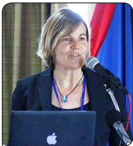
One of the Facilitators at the Regional Meeting in Belize City

Every ministry and department is important, as it must fulfil its unique function as an essential part of the Government which has the full responsibility to manage the nation's affairs and look after the overall interest and wellbeing of the people and country. One of them is the Ministry of Economic