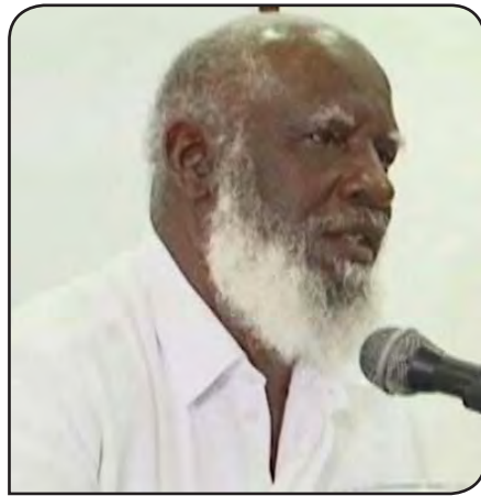
Hon. Wilfred Elrington Minister of Foreign Affairs

"With respect to the meeting with the Secretary General, the Belize delegation expressed our mandate which was firmly to request the extension of the confidence building measures, from where it is now stuck at the western border, all the way to cover the Sarstoon. That was the instructions we got from Belmopan to discuss at that meeting. The Guatemalans took the position that they did not have the mandate to discuss that issue. They had apprised of that before we arrive there. But we could not countenance going there without in fact dealing with that matter. In fact that was the most pressing matter for us. So, notwithstanding their reticence, we impressed upon the Secretary General the importance and urgency of the continuation of the confidence building measures to ensure the security and safety of our people and, most