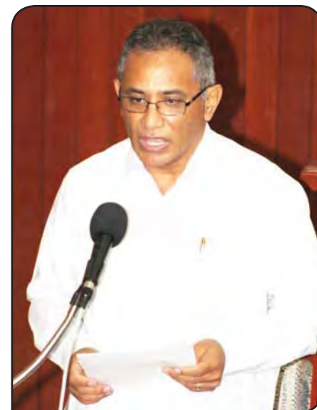
Honourable John Briceno Leader of the Opposition

Briceno extolled the spirit of the Belizean People, but was not as flattering of the Government and its budget proposal: "Mr. Speaker, Belizeans are an incredible people; we are a creative, productive, friendly and compassionate people. For the most part, we are an optimistic people. This 2016/2017 budget, I am afraid, does not reflect any of the qualities that we see in our collective Belizean identity. This is not a budget that is optimistic. This is not a budget for Belizeans. It is not creative, and it is neither hopeful nor resourceful