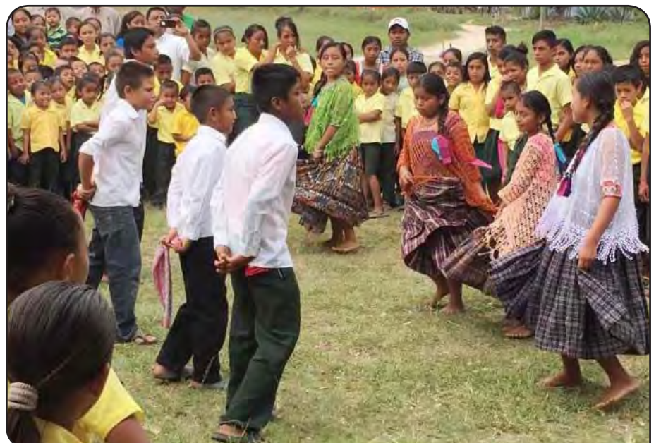
Cultural Dance by students at Trio Primary School in Toledo

Pre-School and Primary School in Belmopan on Tuesday, March 15, 2016. Meanwhile, for Santa Cruz New Government Pre-School and New Government Primary School and Trio Pre-School and Primary School, ground-