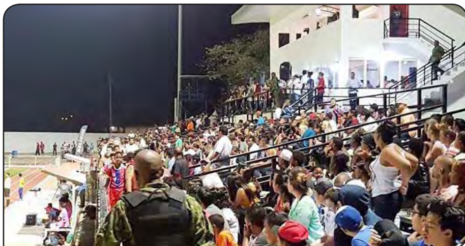
A very good turn-out of fans at the inaugural international friendly

the inaugural football match, Bandits versus the professional football club Progreso from Honduras. Belmopan Bandits lucked out and the match ended 3-0 in favour of Honduras.