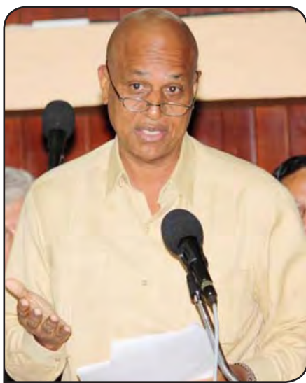
Right Honourable Dean Barrow Prime Minister of Belize

The new Budget Proposal was introduced in the National Assembly three weeks ago on Tuesday March 8, 2016 and debated in the House of Representatives on Tuesday and Wednesday March 22 and 23, after which the House approved it. It is expected to be ratified by the Senate on Tuesday March 29, after which it will be signed into law by the Governor General.