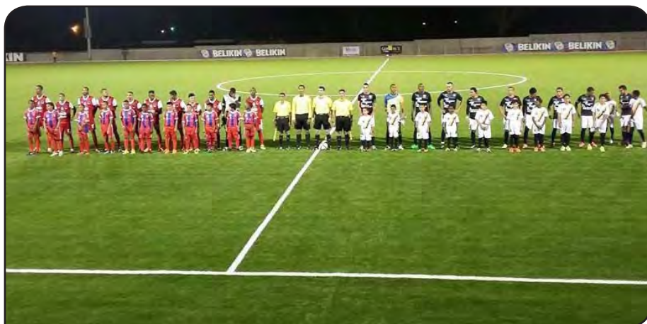
Belmopan Bandits and El Progreso of Honduras take to the new field