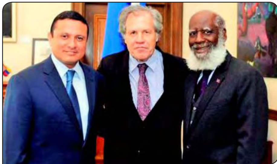
Belize's Foreign Affairs Minister Hon. Wilfred Elrington (left) and Guatemala's Foreign Minister Carlos Raul Morales (right) flanking OAS Secretary General Luis Almagro Lemes (center)