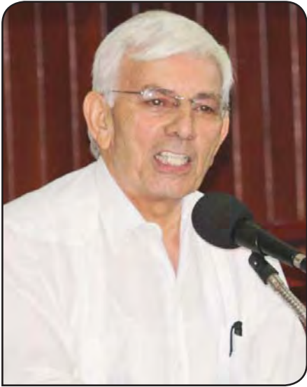
Honourable Said Musa Fort George Representative

O n the Opposition side, the man who filled the second spot, following Hon. John Briceno, was Lake Independence Area Representative Hon. Cordel Hyde, this being his first Budget Debate since returning to the parliamentary fold. Hyde, in his usual down-to-earth fashion, took aim at the Prime Minister's Budget Proposal, calling it empty and irrelevant to the lives of the common people.