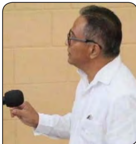
Hon. John Briceno Leader of the Opposition

Indeed, there was at least one member of the Opposition,