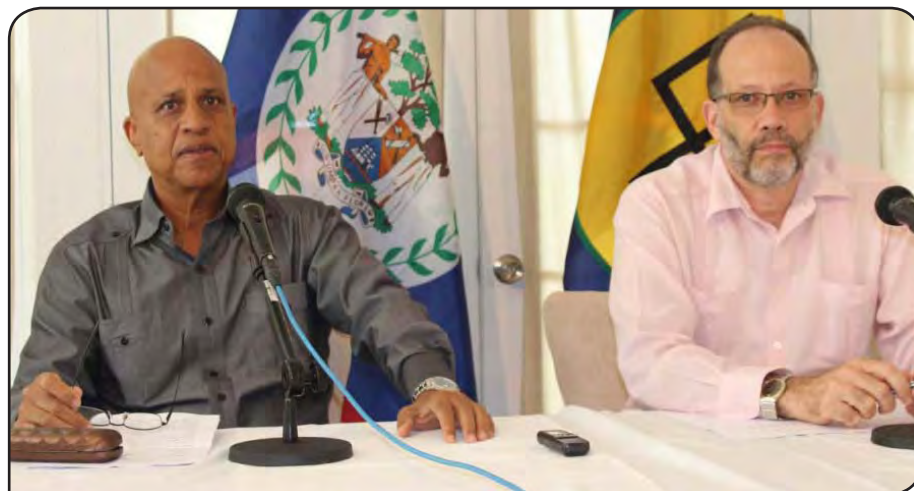
Belize's Prime Minister Honourable Dean Barrow and CARICOM Secretary General H.E. Irwin LaRocque

Court of Justice in accordance with the Special Agreement ratified by both parties. The Community reiterates its strong and unequivocal support for the sovereignty and territorial integrity of Belize and calls on the government of Guatemala to agree to Confidence Building Measures, in conjunction with the Organization of American States, to ensure peace and stability along the southern border of Belize with the Republic of Guatemala." (Guatemala has since issued a defiant and baseless response, which we will not dignify by reproducing it in this publication.)