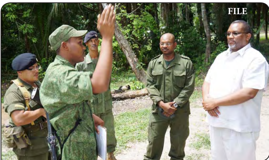
Minister of National Security Hon. John Saldivar visiting BDF Soldiers at an Operation Post near the Belize-Guatemala Border

As we go to press Easter Monday evening, the matter is under investigation by the Ministry of National Security and the Ministry of Foreign Affairs, in accordance with the usual protocol adhered to with respect to such border incidents that have the potential to escalate tensions between our two countries, Belize and Guatemala, which have an unresolved territorial dispute.