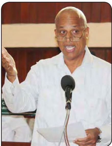
Right Honourable Dean Barrow Prime Minister of Belize

E agerly awaited, this year's edition of the annual debate on the national budget did live up to expectations as far as the fireworks were concerned. But how substantive and productive were the often fiery exchanges? The answer can be as subjective or objective as one wants to be. As objective as we can, let's recap some of the highlights of the two-day debate.