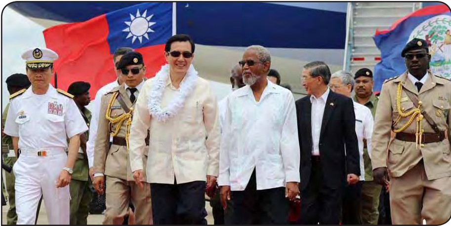
President Ma being welcomed by Governor General Sir Colville Young

"OVER THE YEARS, OUR TWO COUNTRIES HAVE COLLABORATED CLOSELY IN PERFECT HARMONY IN A WIDE ARRAY OF FIELDS, AND STRIDE FORWARD HAND IN HAND IN INTERNATIONAL COMMUNITY"