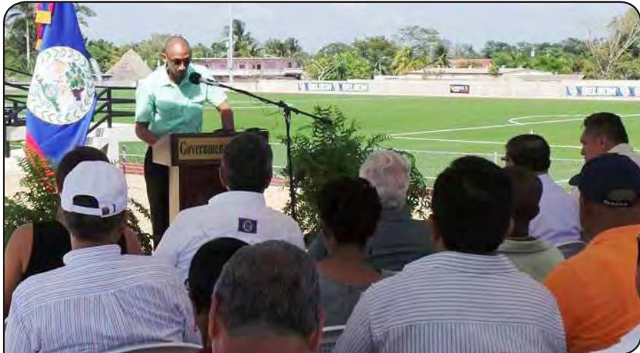
Belmopan Mayor Khalid Belisle Officially Declares the Stadium Open

OFFICIAL OPENING OF ISIDORO BEATON STADIUM IN CITY OF BELMOPAN