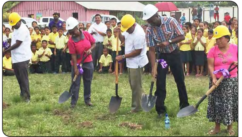
Symbolic Ground Breaking at Trio Primary School in Toledo

Officials included Honourable Patrick Faber, Minister of Education, Culture, Youth and Sports; Honourable Tracy Taegar Pantton, Minister of State, Economic Development, Petroleum, Investment, Trade and Commerce;