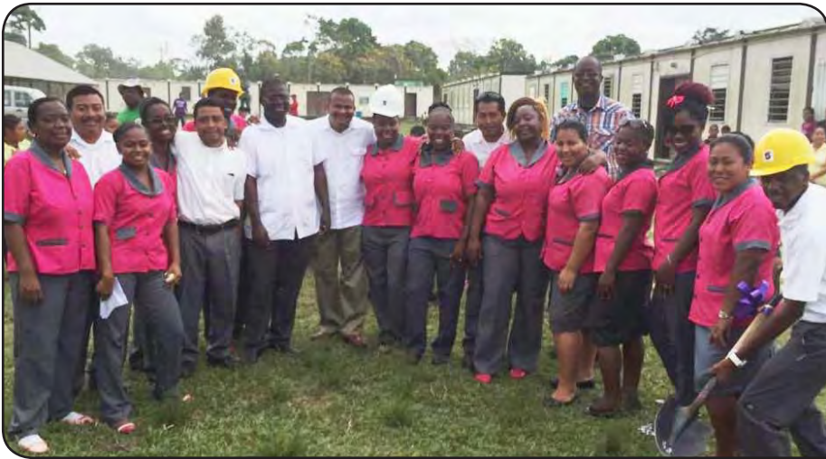
Hon. Patrick Faber with Teachers at Trio Primary School in Toledo

These essential projects are being executed by the Government of Belize through