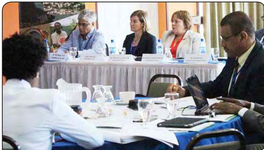
Minister of State Honourable Tracy Taegar-Panton at the Head-Table with other Officials at the Regional Meeting conducted in Belize City

This week, we feature images from a regional meeting hosted by BELTRAIDE a