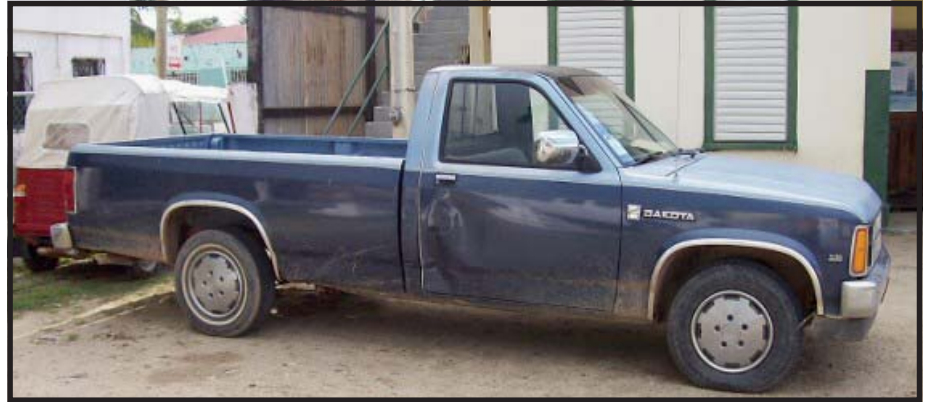
The blue pickup truck at the Dangriga Police Station Compound