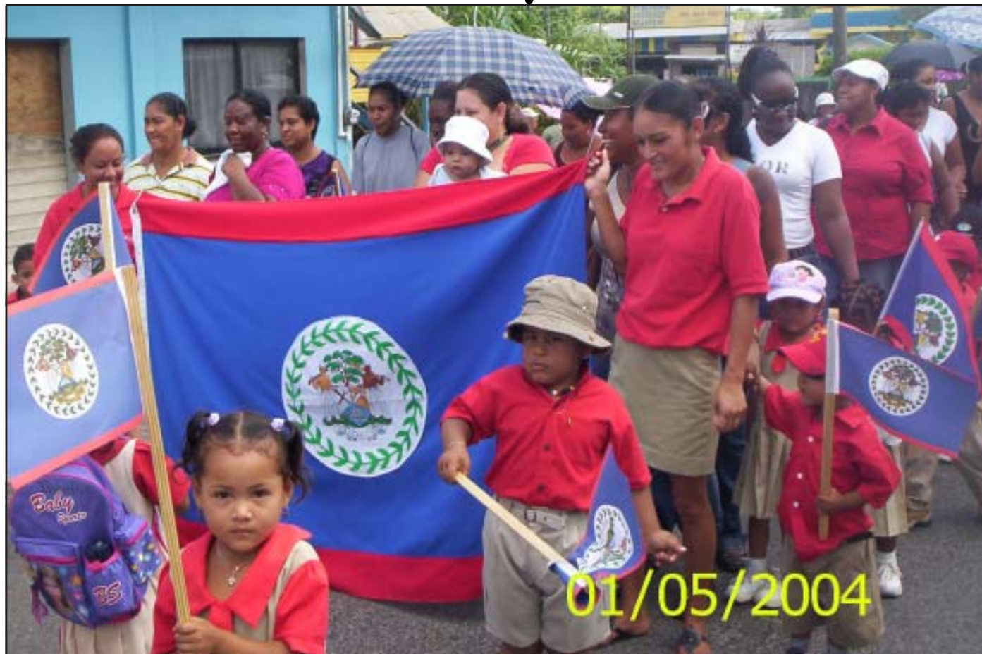
Santa Elena Community Pre-School in the parade

SANTA ELENA TOWN, Cayo, Wednesday, September 19, 2007: