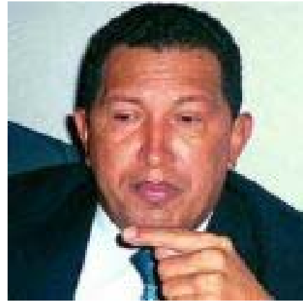
Venezuelan President Hugo Chavez

The defeated reform package would have created new types of communal property, let Chavez handpick local leaders under a