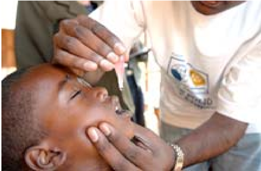
A child receiving polio drops

The Rotary Club of San Ignacio is one of seven clubs in the country of Belize and is part of a Rotary District that includes Guatemala and Honduras. Currently, the San Ignacio club has 26 members who work hard to live up to their motto of “Service Above Self” by providing educational, medical and other assistance within the community.