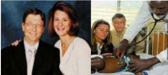
Bill & Melinda Gates Looking on as a child is being attended

The Rotary Foundation has received a $100-million Gates Foundation grant, which Rotary will raise funds to match, dollar-for-dollar, over three years. The organization will spend the initial $100 million within one year in direct support of immunization activities carried out by the Global Polio