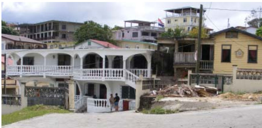
Police reports no personal injuries and minor damages to the building

One eyewitness reported seeing "fire" coming from the area as the