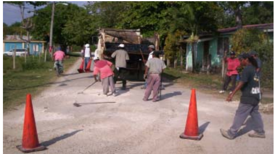
Working in harmony, like the way it should be -Ministry of Works & Town Council employees repairing streets in Santa Elena Town

the community in a more timely manner as well as dispensing with that LARGE amount of warrants held up in the police station under the excuse of the lack of transport to execute this essential police duty.