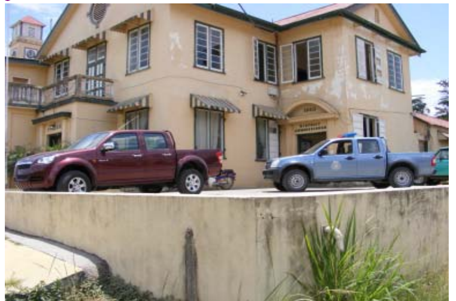
San Ignacio Police now has two vehicles in top shape - The new Great Wall 4 door Truck (L) and the relatively new D-Max (R) both seen here parked on the compound at the San Ignacio Police Station

brand new acquisition and another one that was received also brand new only a few months ago.