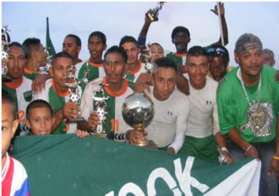
Hankook Verdes Team with their hard earned Championship Trophy