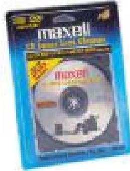
CD Lens Cleaners