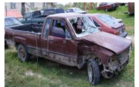
The damaged Toyota pickup truck at the police compound

Police are asking the driver to the Toyota pickup truck to come forward thereby enabling the investigation to proceed.