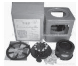
Acros & Whirlpool Stove Parts