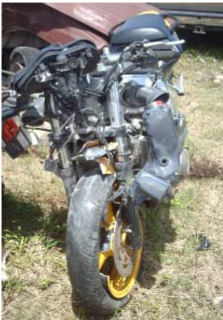
The remains of the victim’s 600cc Kawasaki Motorcycle