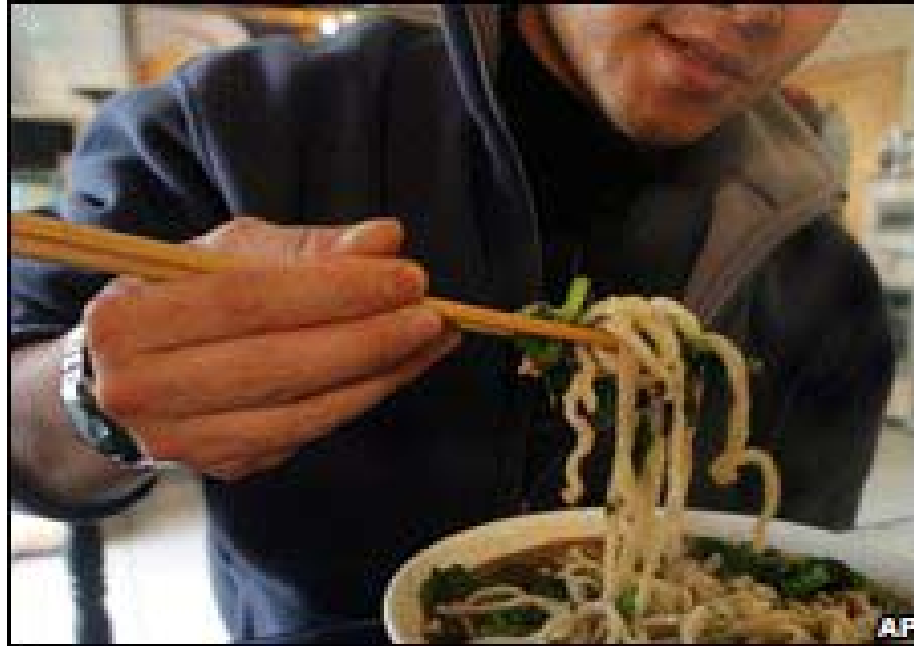
Dog meat is eaten in several Asian Countries

The measure has been implemented to “ respect the habits of many countries and nationalities, ” the Beijing News quoted the municipal food department as saying.