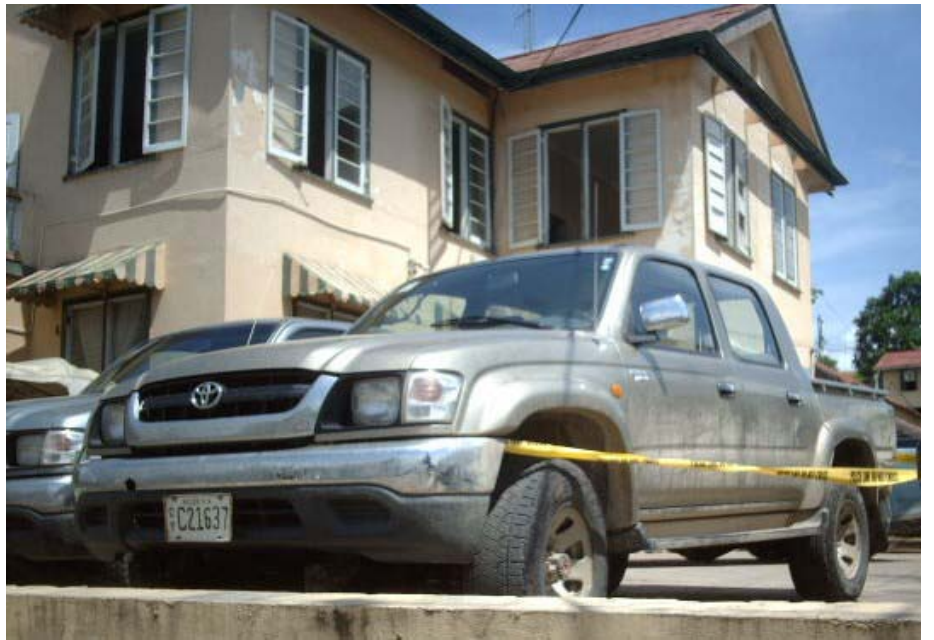
The victims' two Toyota Hilux at the San Ignacio Police compound