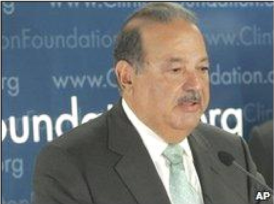
Mexican tycoon Carlos Slim is now worth US$53.5bn

One of the most significant in Mr Slim's empire is America Movil, Latin America's largest mobile phone company, which operates in 11 countries and serves more than 150 million