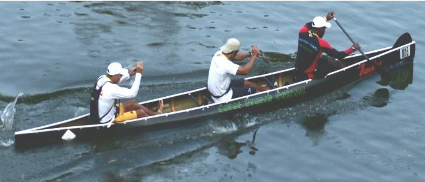
Team Zip Rider, Winners of the 13th Annual La Ruta Maya River Challenge