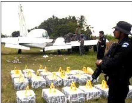
Mexican Drug Gangs Are Said To Be Increasingly Operating Through Guatemala