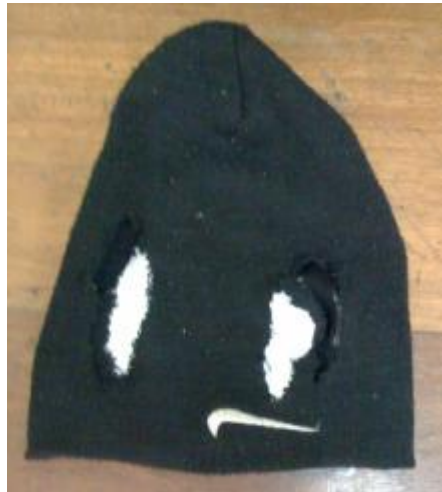
The black Nike warm cap/mask

office, on one of the desks, police recovered a black Nike warm cap converted into a mask along with a hacksaw bracket fitted with a blade. Police believe that the hacksaw was used to cut the burglar bar and the door off the safe.