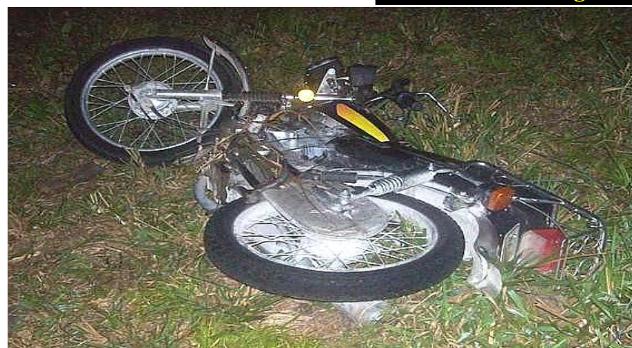
The Victim's Meilum, 125 cc, Motorcycle On The Scene

The victim was found with a large cut wound to the throat almost severing the head. Police also found a blue Meilum, 125 cc, Motorcycle, on the ground