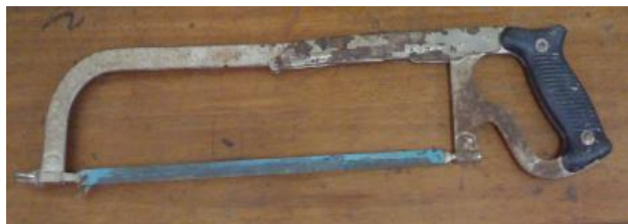
The hacksaw bracket complete with blade