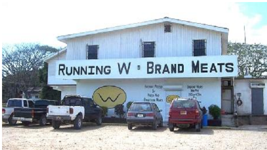
Home of Running W Brand Meats, Mile 63, Western Highway, Central Farm, Cayo

Police visited the scene where preliminary investigation revealed that entry was gained by cutting the burglar bar from an upstairs window on the western side of the building. An aluminium "A" frame ladder, found on the scene, is suspected to have provided access to the