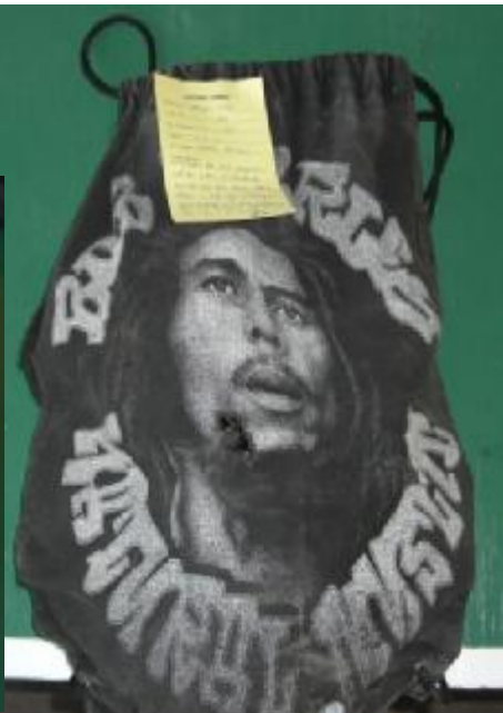
And The Bag

seat immediately behind the passenger. The individual acknowledged ownership of the bag and when it was searched, the bag was found to contain suspected