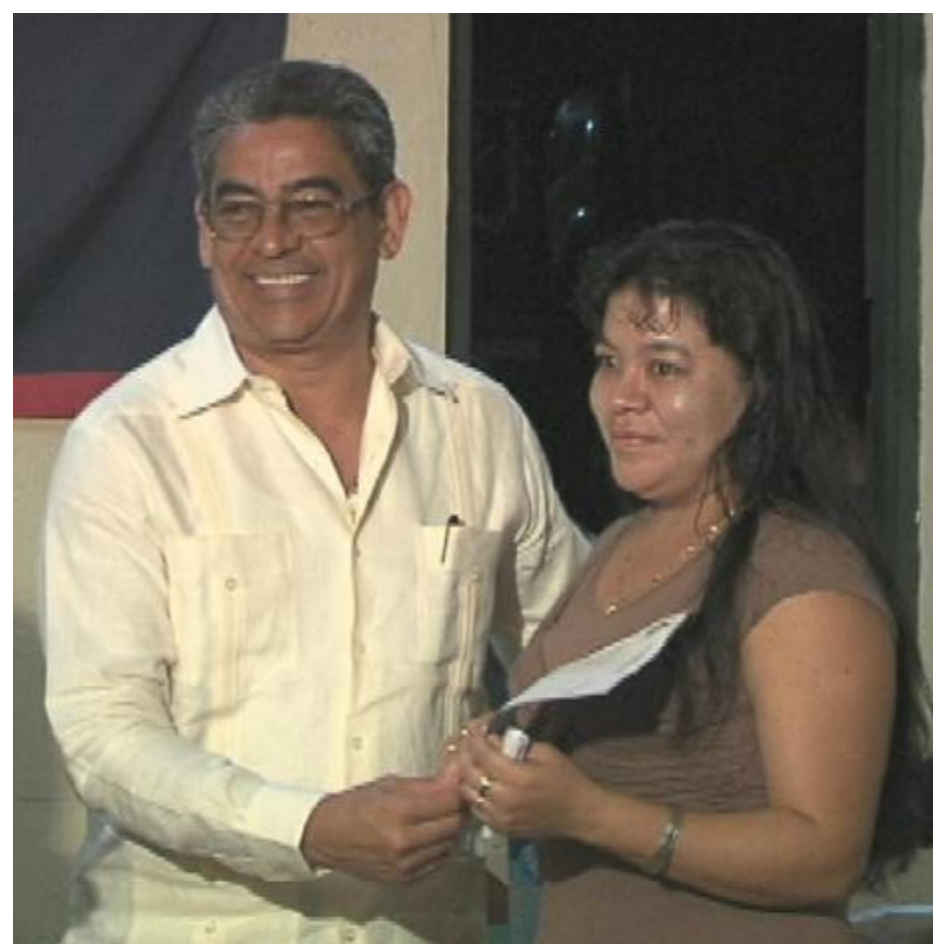
Deputy Prime Minister Hon. Gaspar Vega and another of the over one hundred proud landowners

In an interview with the media, Commissioner Segura informed that a parallel criminal and internal investigation is currently underway to get to the very bottom of this historic display of gross indiscipline within the ranks of the department which,