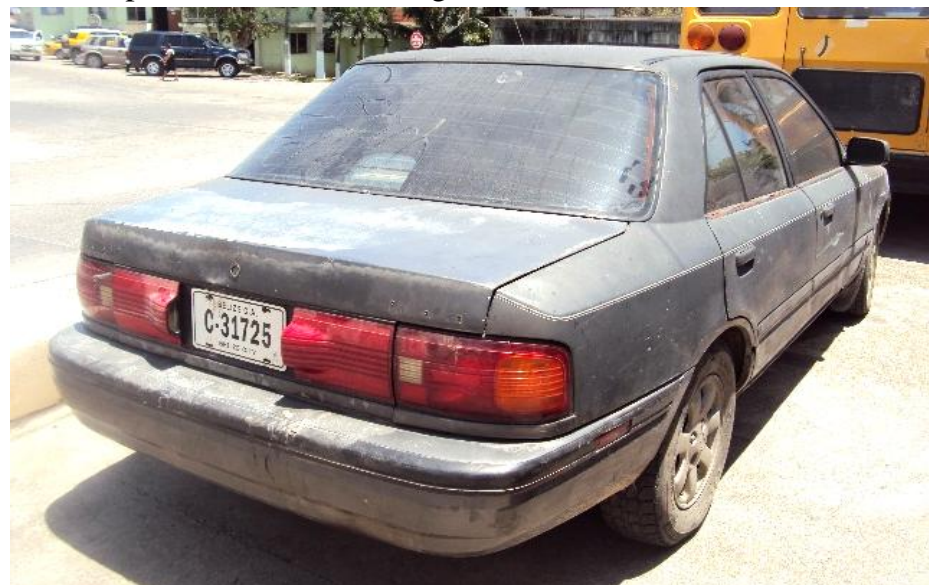
The car, with Belize City license plates C-31725 parked on the compound at the San Ignacio Police Station

In a further surprising turn of events, with Young's guilty plea, no determination was made regarding the confiscation or otherwise of the car which remains parked on the compound at the San Ignacio Police Station.