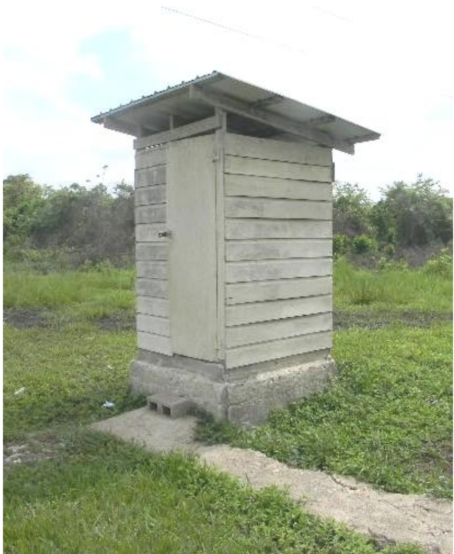
BEFORE - The Bathroom Facility At Santa Familia RC

the ceremony by thanking everybody involved with the project and assured the Rotarians that the school would indeed