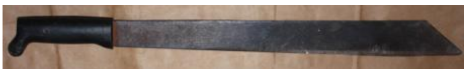
The Machete Found On The Scene Near The Body