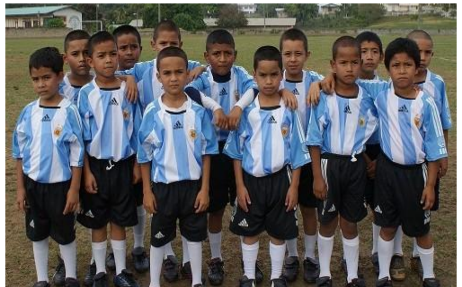
Argentina, Liga Mosquitos