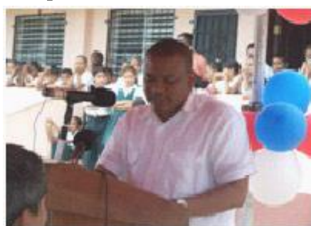
Minister of Education and Youth, Hon Patrick Faber, delivering the keynote address

As keynote speaker for the momentous occasion, Minister Faber told the gathering that amalgamation is key to the Ministry's efficient use of education funds. He emphasized the importance of putting differences aside for the best interests of our