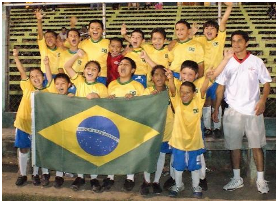
Brasil, Campeon Del Maraton Liga Mosquitos

En la rama Mosquitos, Argentina se quedo con el tercer lugar al caer por doble eliminación, por lo que la gran final se jugo entre las selecciones de Brasil y Belice, en el tiempo normal, los pupilos de