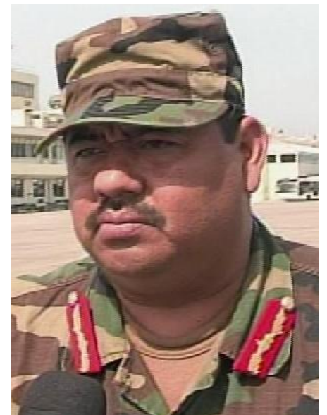
Commander, Belize Defense Force General Dario Tapia

The authorities of the three countries highlighted the need