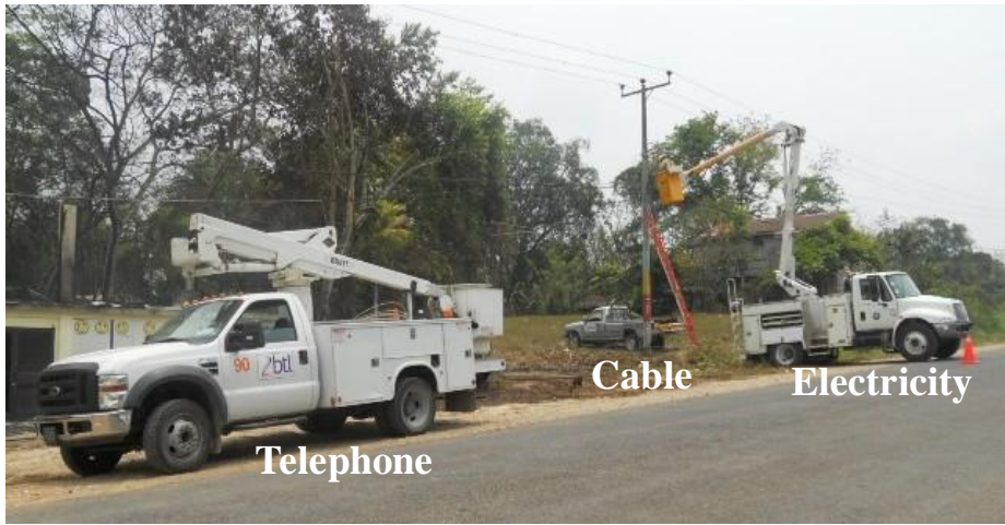
Telephone, Cable And Electricity Crews On The Scene

While no one could ascertain the value of the building, a Happy's Night Club employee informed that while the loss is much, much more, his cursory on the surface estimate of losses includes an entire sound system valued at around forty thousand dollars, seven thousand dollars worth of stock ( beers, rum & soft drinks ) and about four thousand dollars worth of computers as well as several thousand dollars worth of furniture and pool