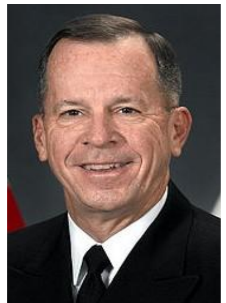
Chairman of the Joint Chiefs of Staff, USA Admiral Michael Mullen

for cooperation "cross between Mexico and Central America, the importance of sharing information, the control of mutual trust and the training of human resources in order to obtain better results" .