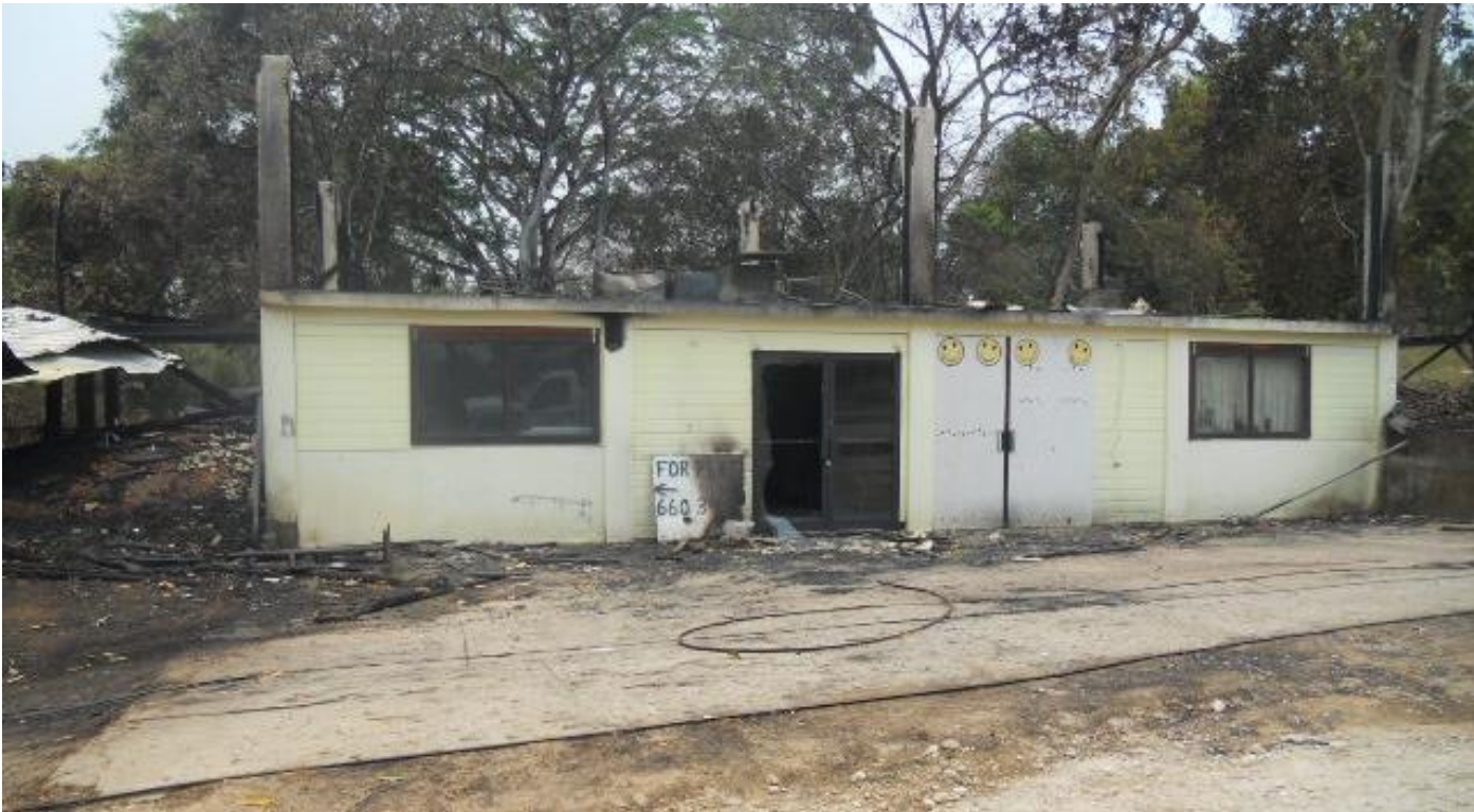
Happy's Night Club - Red Creek, Santa Elena, Cayo - Completely Destroyed By Fire - Only A Downstairs Cement Portion Remains

A male Asian employee, who was one of three persons in the building at the time of the blaze, informed that the club was closed for business several hours earlier and that he was sleeping in a downstairs room. He said that a male and female couple was also sleeping in a separated bedroom downstairs, when at approximately 3:30 am, he was awoken by a commotion coming from upstairs. He said