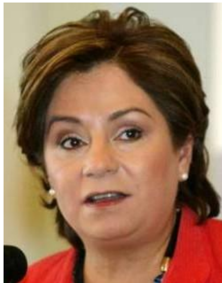
Chairing the meeting, Mexican Foreign Secretary Patricia Espinosa

The event was chaired by Mexican Foreign Secretary