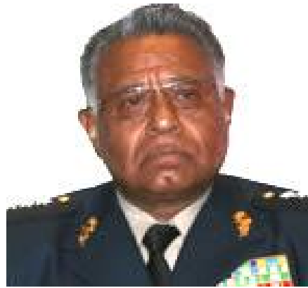
Mexico's Defense Secretary, General Guillermo Galván-Galván