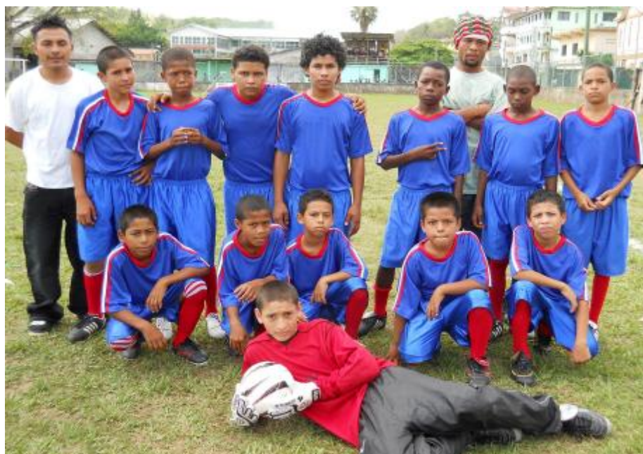
Unitedville Rockets (photo above) defeated Adventures by a score of 2 goals to 1

And in the third game of the day 7 Miles defeated Cristo Rey