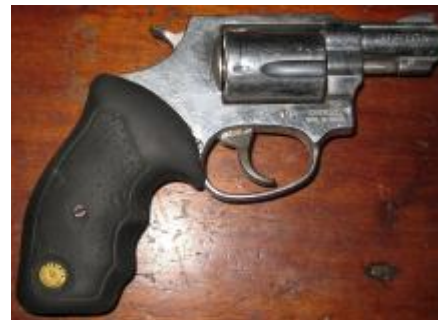
the .38 Smith & Wesson Special Revolver

appeared to be a gunshot wound to the right forearm. He was immediately transported to the San Ignacio Community Hospital where he was treated and released into police custody later that morning.