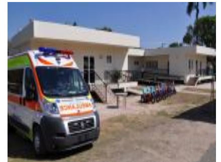
Benque Viejo Polyclinic and new Ambulance donation

The Ministry of Health in collaboration with the Ministry of Economic Development officially inaugurated the Benque Viejo Polyclinic on Wednesday April 13 th , 2011 at its project site.