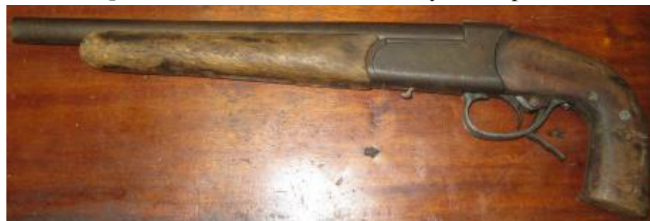
The 16 gauge shotgun with the barrel cut short

They were kept at bay inside the store for almost two hours when at around 2:40 am the Quick Response Team from the