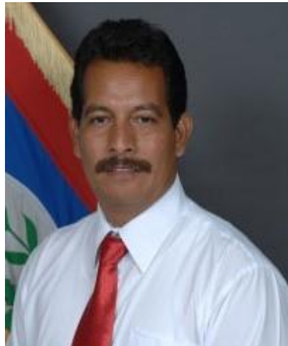
Minister of Health, Hon. Pablo Marin

The Ministry of Health commemorated World Health Day on April 7th, 2011. This day is celebrated every year to mark the founding of the World Health Organization. This year the focus was on the issue of antimicrobial resistance under the theme, "No action today – No cure tomorrow!"