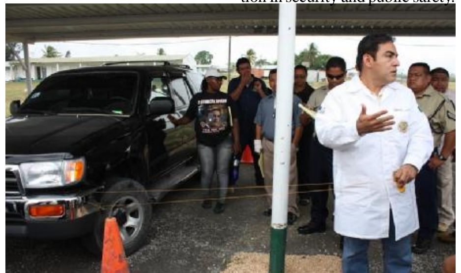
In The Field - The Mexican Ballistics Expert (far right)

For his part the representative from the Embassy of Mexico reiterated the commitment of the Mexican Government to contribute to the strengthening of Belize's law enforcement capabilities and pledged to continue the bilateral cooperation in security and public safety.