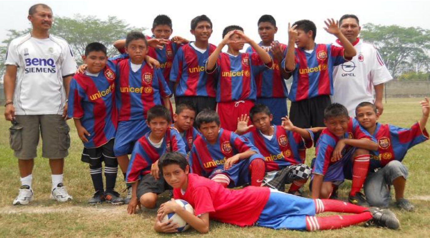
Cristo Rey's Juventus Jr BOMBED Unitedville Swifter by 7 to NIL