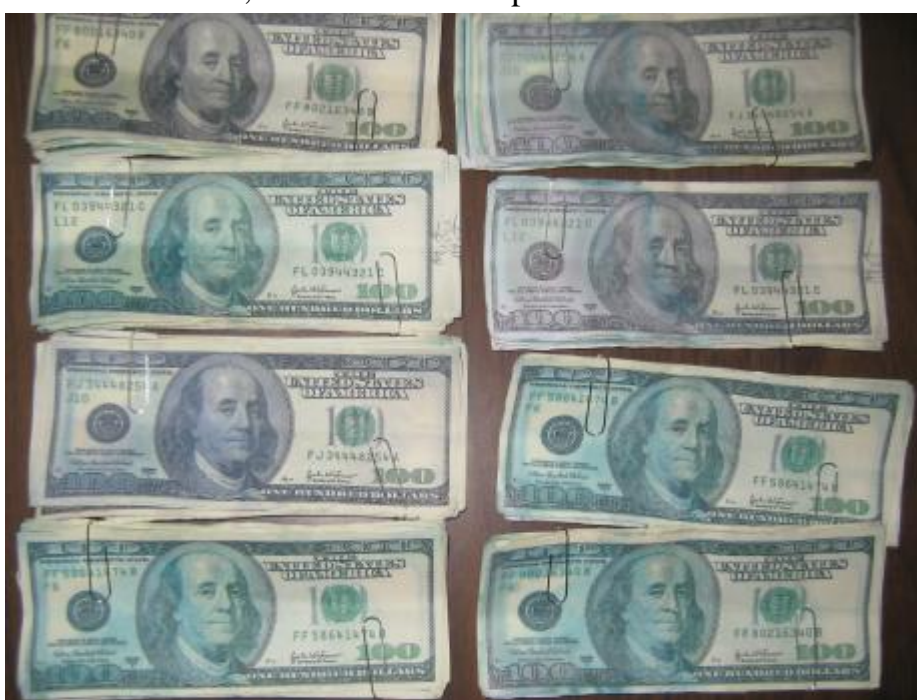
A Sample of David Sedacey’s Wad

The police advises the public to be on the lookout for counterfeit US $100.00 notes in circulation and that if you should come in contact with anyone who has any of these bills , you are asked to please contact the nearest Police Station or 0800922TIPS.