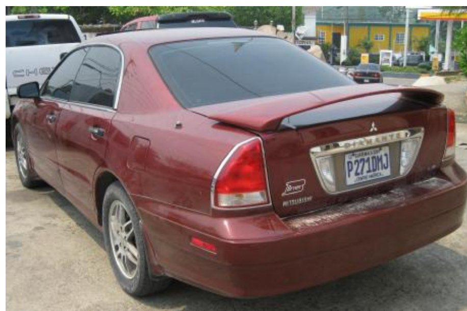
Budna's red, four- door Mitsubishi Diamante car with Guatemala 2004 license plates P271DMJ, at the police station compound in San Ignacio

Both individuals were detained, cautioned and transported, along with the car and the suspected marijuana, to the police station in San Ignacio town where the car was impounded and the three parcels were weighed amounting 454