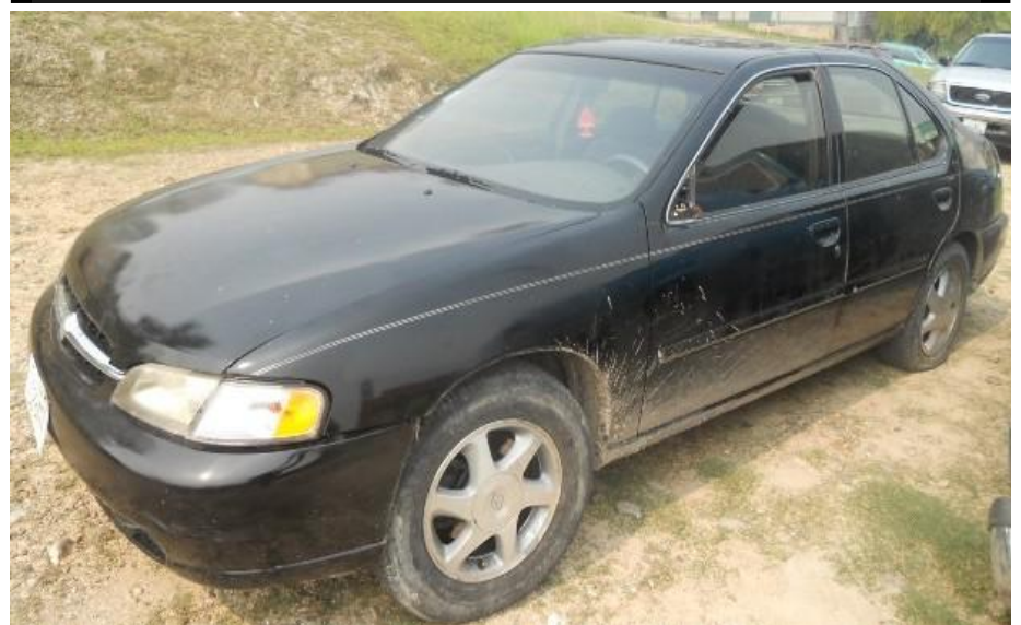
Morgan’s black - 4 door - Nissan Altima car with license plates CY-C-28417

charge of handling stolen goods will be levied on all three accused.