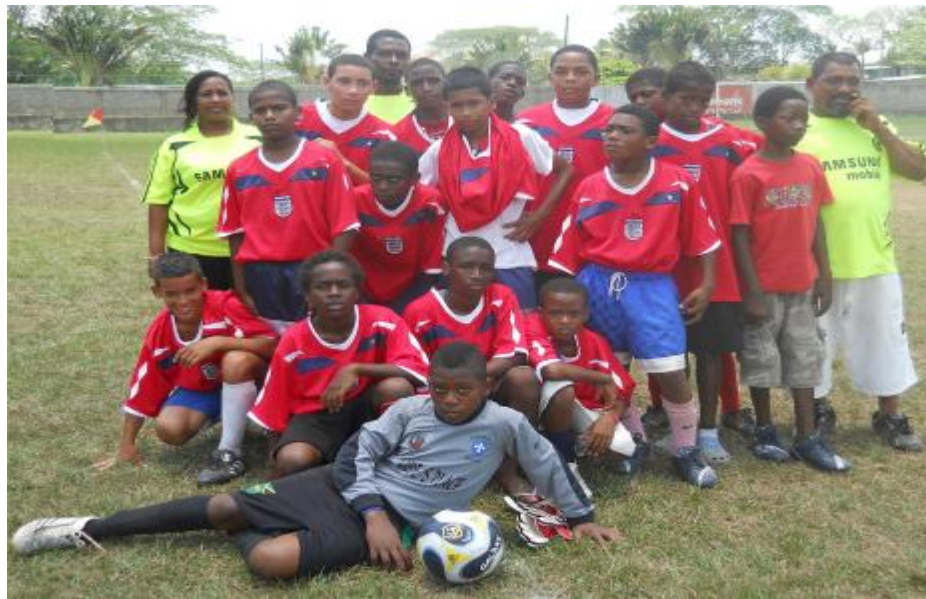
Esperanza's Gentle Touch (photo above) played to heated 1-1 draw against Stealth Bombers from El Progreso (7 miles)

In the third game of the day Adventures Football Club