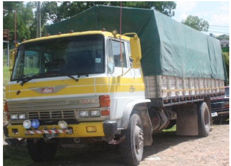
The yellow and white Hino cargo truck with SI/SE license plates A-00135

this Friday morning, the latest information reaching us is that, when the six accused men were returned to the San Ignacio police station on Thursday evening, after being detained for several hours in the custody of Customs at the Western Border Station, Darwin Ottoniel Guerrero , was released by the police without charge on instructions from Customs.