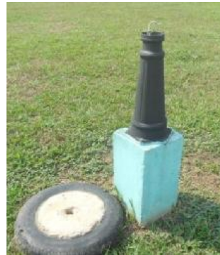
The first light destroyed with only the base remaining the remnants long gone

We take this opportunity to call on the police to not take lightly the destruction of public property and for magistrates to impose the maximum penalty upon any person convicted of such irresponsible action as maybe only in so doing will a sense of social consciousness be