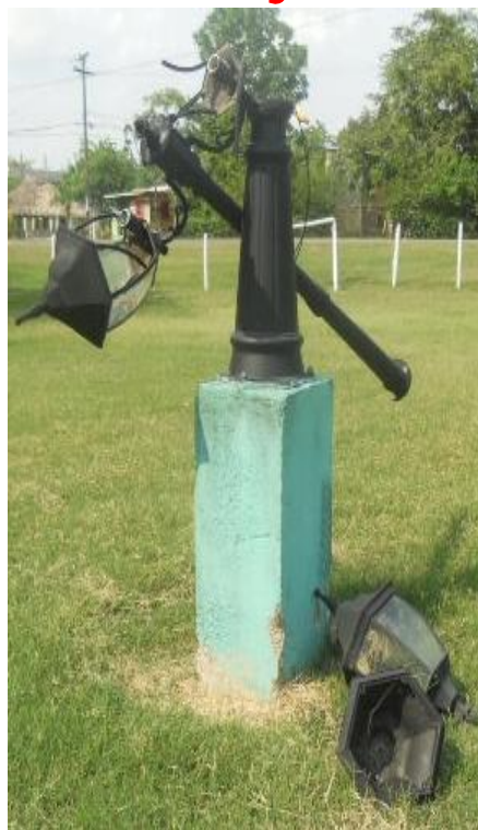
The light fixture in the Macal River Park destroyed by vandals

following questions: Where is our civic pride? How is it that we can conduct ourselves in a