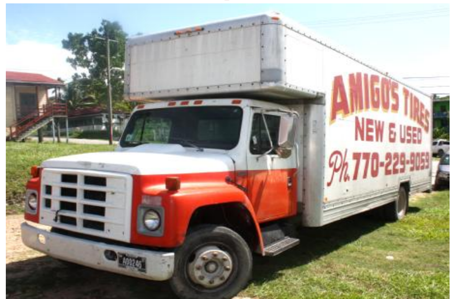
The red and white International cargo truck with SI/SE license plates A-00246