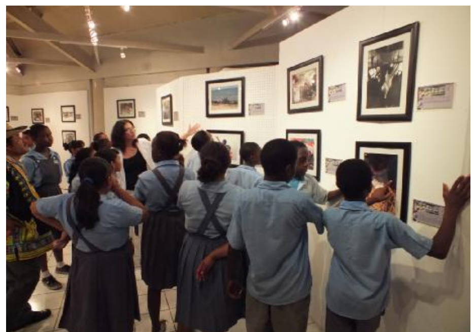
Students viewing the photo exhibition