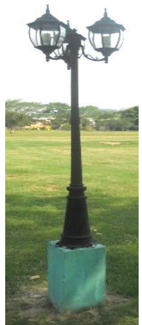
One of the other 14 lights still standing in the park

instilled upon those who insist on destroying the very little we have.