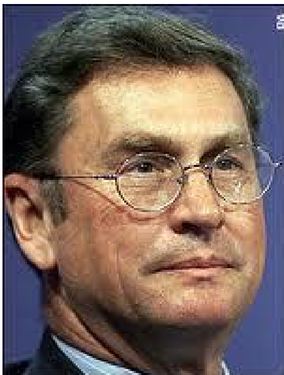
Michael Ashcroft, 65

“The (British) prime minister should not run scared of Ashcroft but should force him either to suspend this legal action or to step down.”