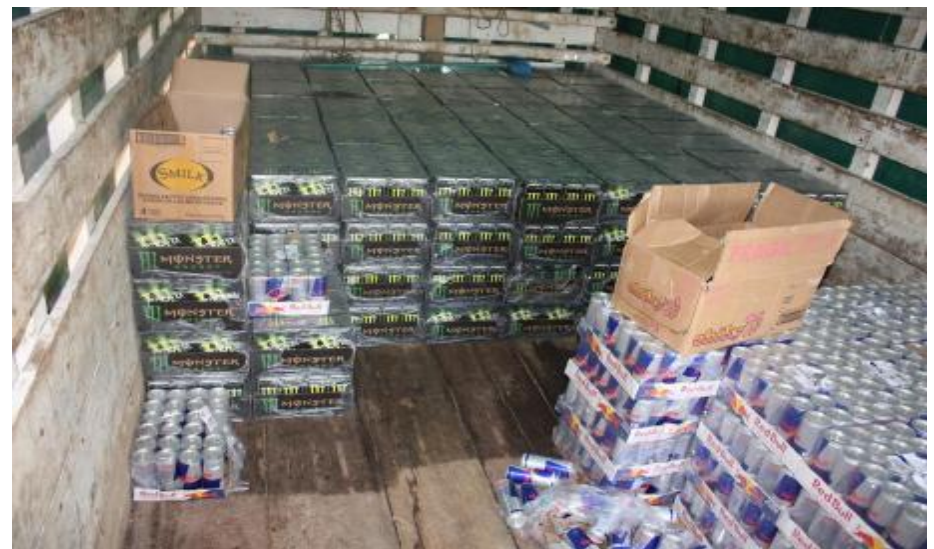
The Monster and Red Bull Energy Drink