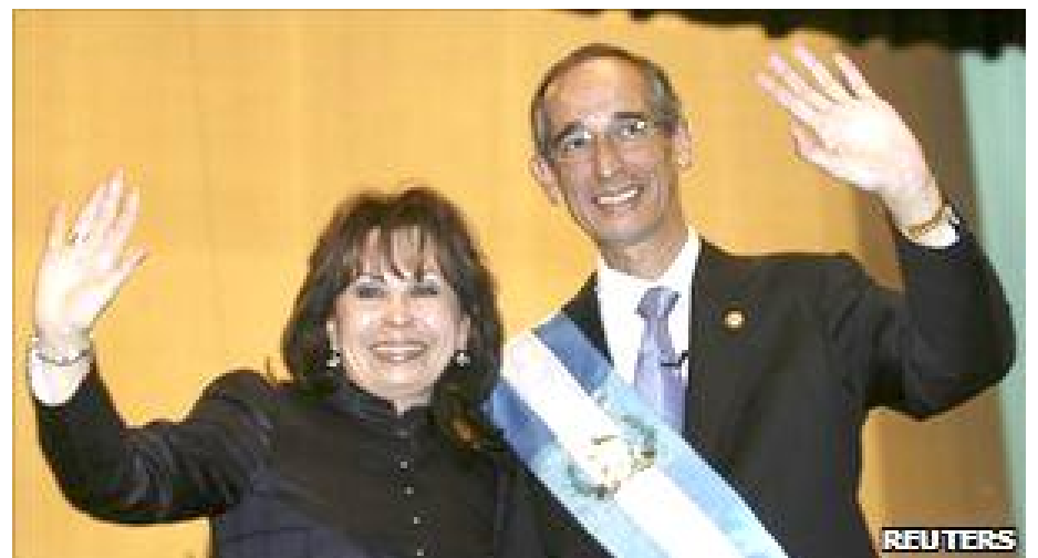
Guatemala's ex-first lady Sandra Torres and her husband President Alvaro Colom, before the divorce

she said that she divorced her husband for the love of her country