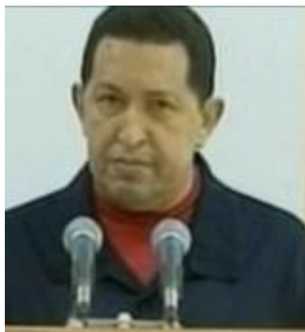
Venezuelan President Hugo Chavez