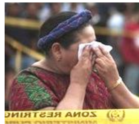
A Tearful Rigoberta Menchu

early 1970s as a protest singer in Argentina.