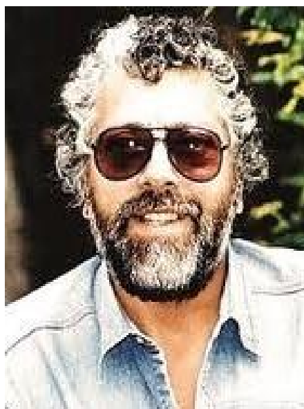
Facundo Cabral, 74

"What pain! We cry with Argentina and all of our great fatherland," tweeted President Hugo Chavez of Venezuela.