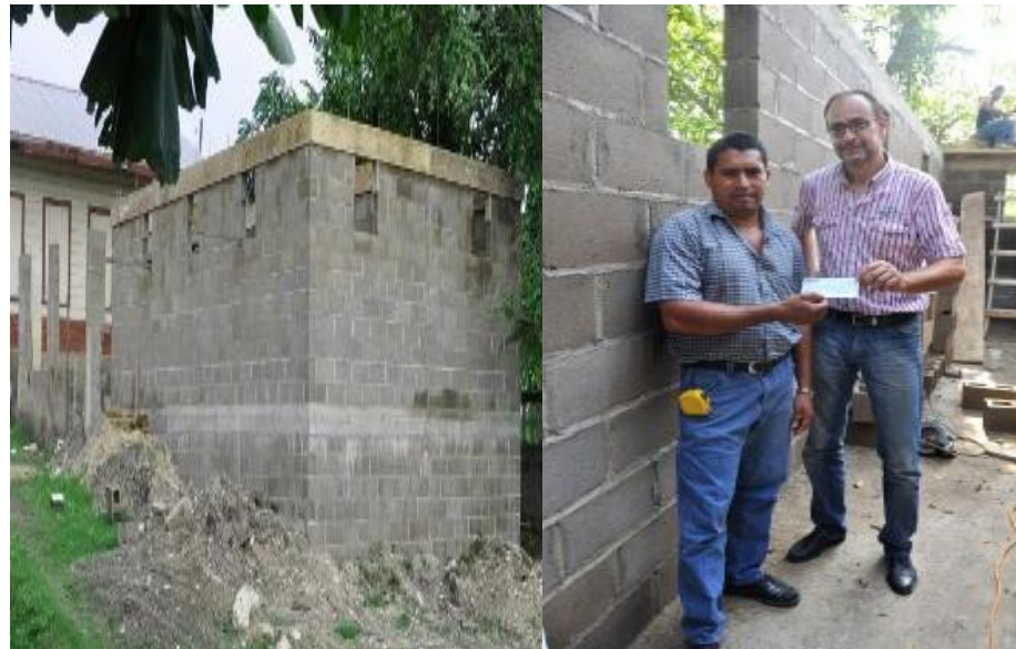
Sacred Heart Primary School Toilet Block

To make this charitable work sustainable, the Sacred Heart School principal has committed to implement and supervise additional cleaning and maintenance activities for the new facilities as well as to include financial considerations for extra cleaning time. Continuous health education and hygienic measures will be integrated into the curriculum to reinforce