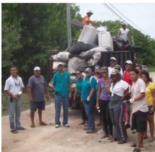
Taking A Break For A Photo Opportunity

According to Raymond Mossiah, Sustainable Tourism Officer at the BTB and head of the BTB Green Team, "Belize is a natural resource-based tourism product. Pollution is not