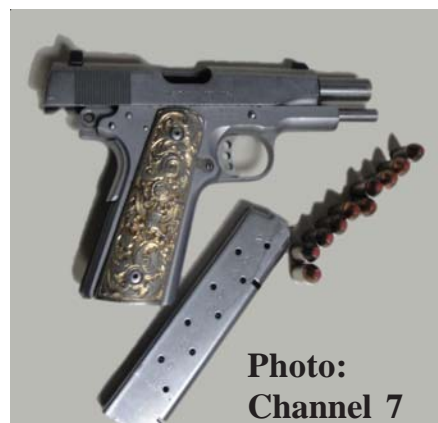
Colt brand, point 45 pistol with serial number FC27130

from the left front pocket. The officer noted his reluctance to do the same with the other front pocket as he began walking away. Sensing a developing situation another officer came to the assistance of the first officer ordering the Guatemalan to halt. The first officer then proceeded to search the Guatemalan and in the process retrieved the chrome, Colt brand, point 45 pistol with serial number FC27130 loaded