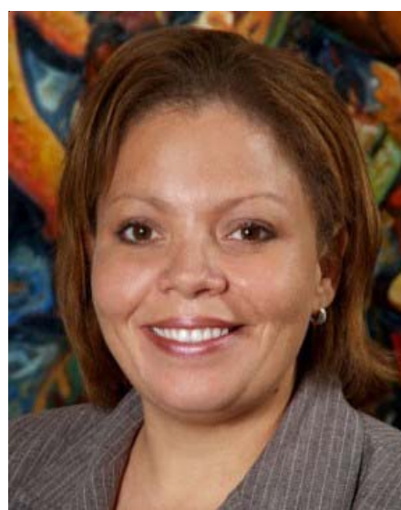
New CEO, Ministry of Tourism and Culture Tracy Taegar-Panton