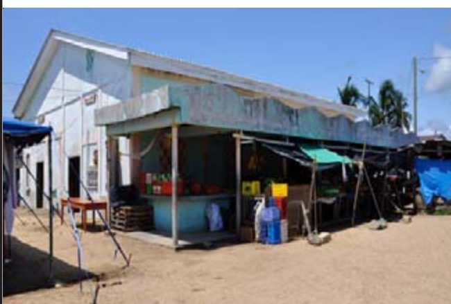
Existing Market Building

The project, which is expected to begin in the next two weeks, will rehabilitate the existing