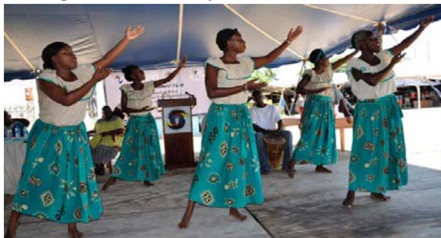
Lirahunu Satuye Cultural Group