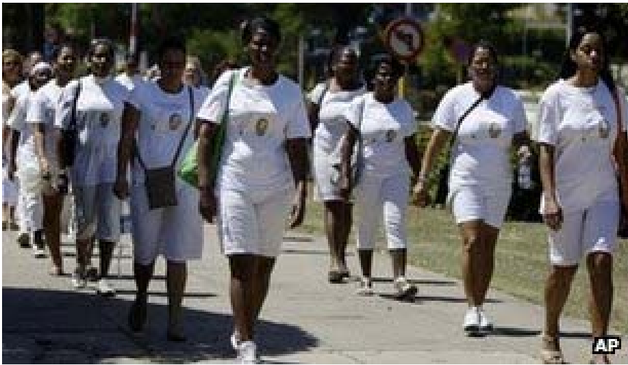
Members of the Ladies in White dissident group have been briefly held