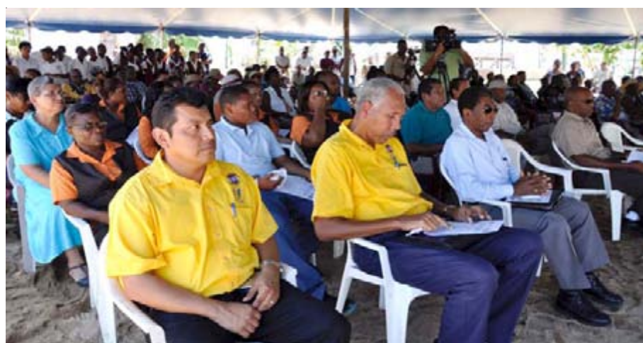
Members of the Implementation Unit at the ceremony

The project is focusing on three main categories namely: