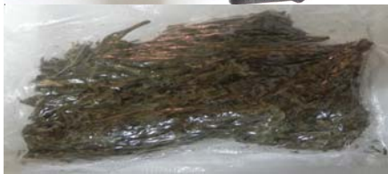
The Cayo Weed

"Home Invasion" which occurred in the Bradley's Bank area of Santa Elena town and, as usual went unreported in the media as police continues to keep the lid on these types of serious crime. No one was arrested and