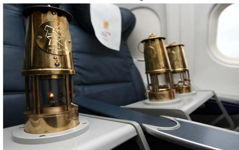
The Torch, on the flight to London

So how do you get the flame to London from Greece you may be asking? Well when you're the biggest celebrity on the planet, private plane of course. Seriously, no joke and if you still don't believe me check out the picture above. Yes even the Olympic Flame is required to wear a seat belt.