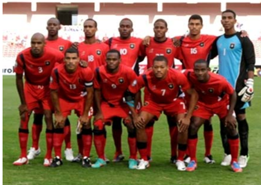
Belize A Team Takes On Honduras Friday at 5:30 PM