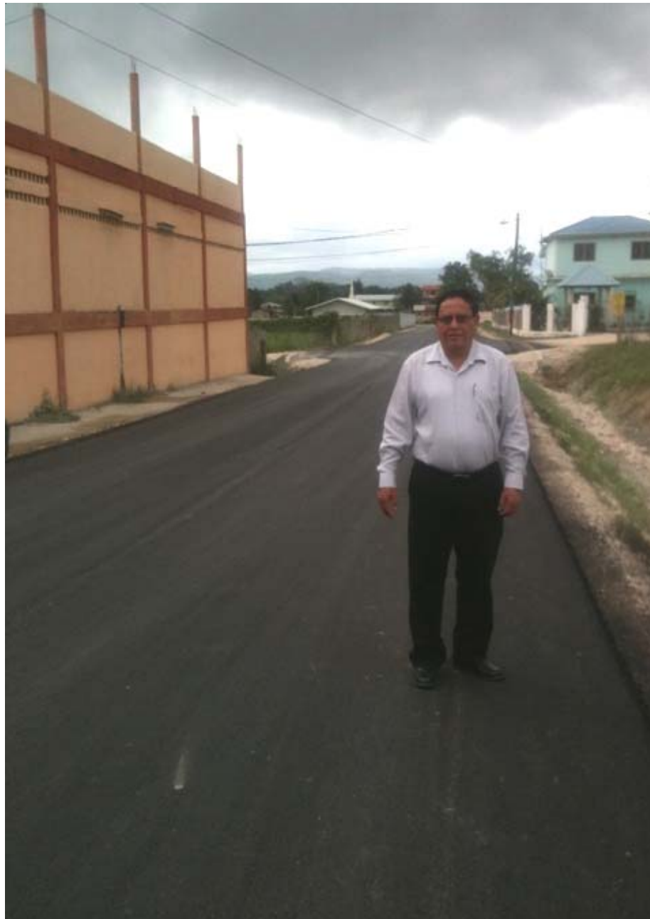
Hon. Rene Montero, Minister of Works and Transport Inspecting Works On Lily Street Beside Three Flags

As street upgrading works continues in Cayo Central, the Ministry of Works project is underway to pave the entire Carmen Street, with Salazar Street and Bishop Martin Street, also in Santa Elena to follow soon. This project