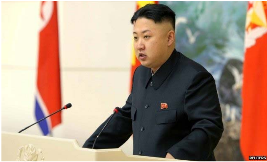
Kim Jong-un, North Korea Leader

"We do not hide that the various satellites and long-range