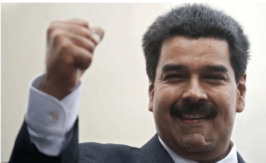
Venezuelan Vice-President Nicolas Maduro

Mr Maduro referred to the alleged plot after announcing he would travel to Cuba on Wednesday along with Oil Minister Rafael Ramirez to see