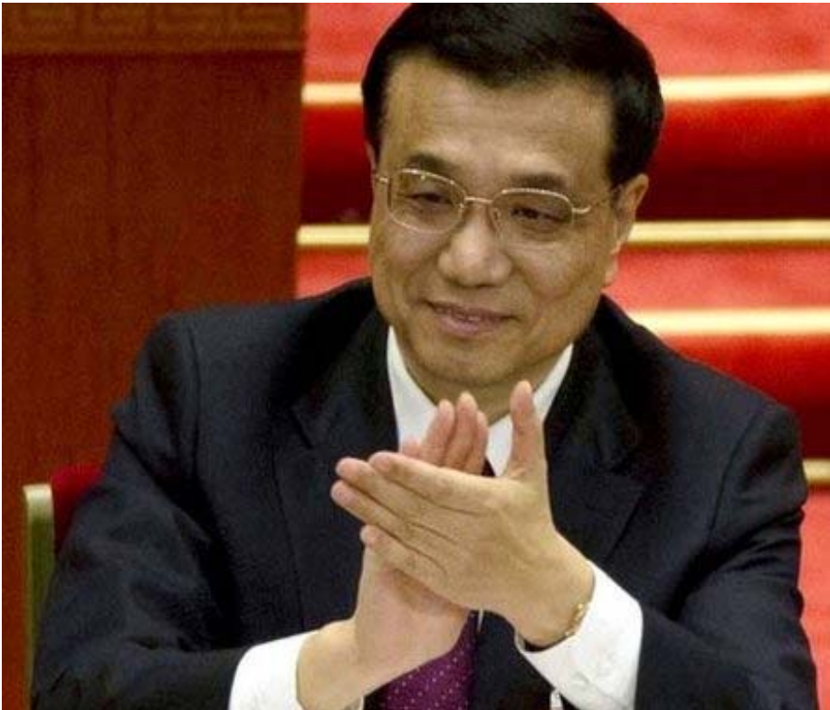
Mr Li, the son of an official in Anhui, is a fluent English speaker

Mr Li, 57, who is seen as close to outgoing leader Hu Jintao, speaks fluent English and has a PhD in