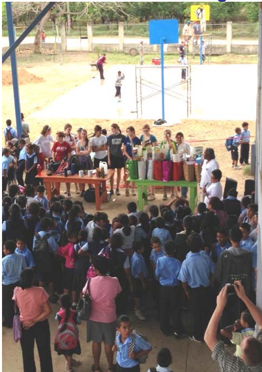
Handing Over Ceremony At St. Andrews School