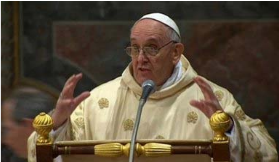
Pope Francis: "I would like all of us... to have the courage to walk in the presence of God"

The Vatican's account of his first hours in the top job on Thursday also emphasised Pope Francis's humility, describing how he shunned a special car and security detail provided to