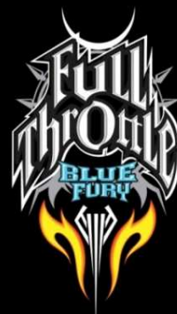
1 Case Full Throttle