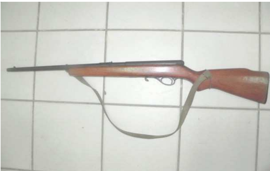
Armscor brand, model 20P, point 22 caliber rifle