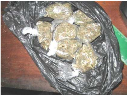
Black bag containing seven smaller transparent plastic bags

The first black bag was found to contain seven smaller transparent plastic bags all containing suspected marijuana. The second bag had inside, 36 smaller transparent plastic bags all containing suspected marijuana and