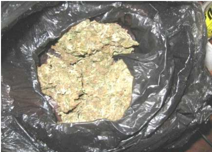
Black bag containing loose Marijuana

the third black plastic bag was found to contain a loose amount of suspected marijuana. Despite being advised of their right to remain silent, two of men began accusing each other of being the owner of the suspected marijuana.