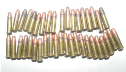
Forty point 22 live rounds