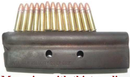
Magazine with thirteen live rounds

men were gathered, led to the discovery of an Armscor brand, model 20P, point 22 caliber rifle loaded with a magazine with thirteen live rounds. Further checks led to the discovery of a transparent plastic bag containing an additional forty point 22 live rounds.