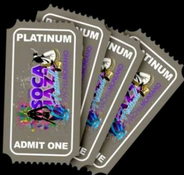
4 Platinum Tickets

Win the ULTIMATE CONCERT PACKAGE Text "SOCA" to 2014