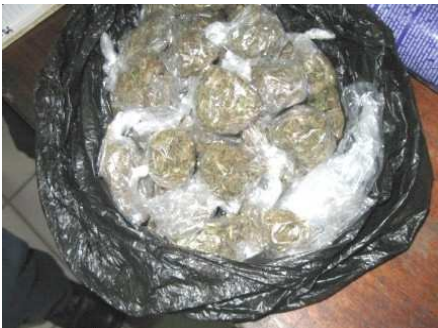
Black bag containing 36 smaller transparent plastic bags

All four persons were detained and transported, with the suspected weed, to the police station in San Ignacio where the merchandise was