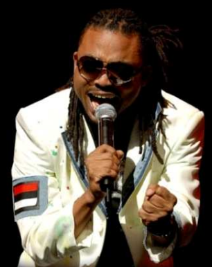
Chance to meet Machel Montano

• Winner will be announced on 16 th September, 2014 • Only DigiCell Customers • 50¢ + GST per SMS