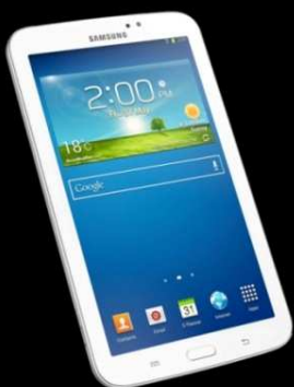
1 Samsung Tab 3