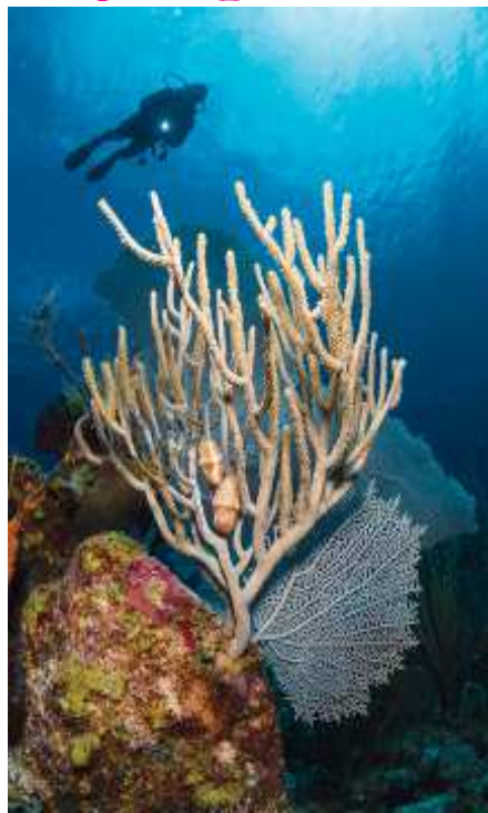
Manta Wall in Placencia

Some of the highlights from the three-page spread include mentions of our barrier reef “ bowing only to Australia’s great one. ” It also talks about the wall dives that can be done along the atolls, which “ turn into an underwater Lollapalooza. ” Also among the highlights was Gladden Spit which placed in the top 5 list for “ best big animals in the Caribbean and Atlantic region. ” Apart from our “ big animals, ”