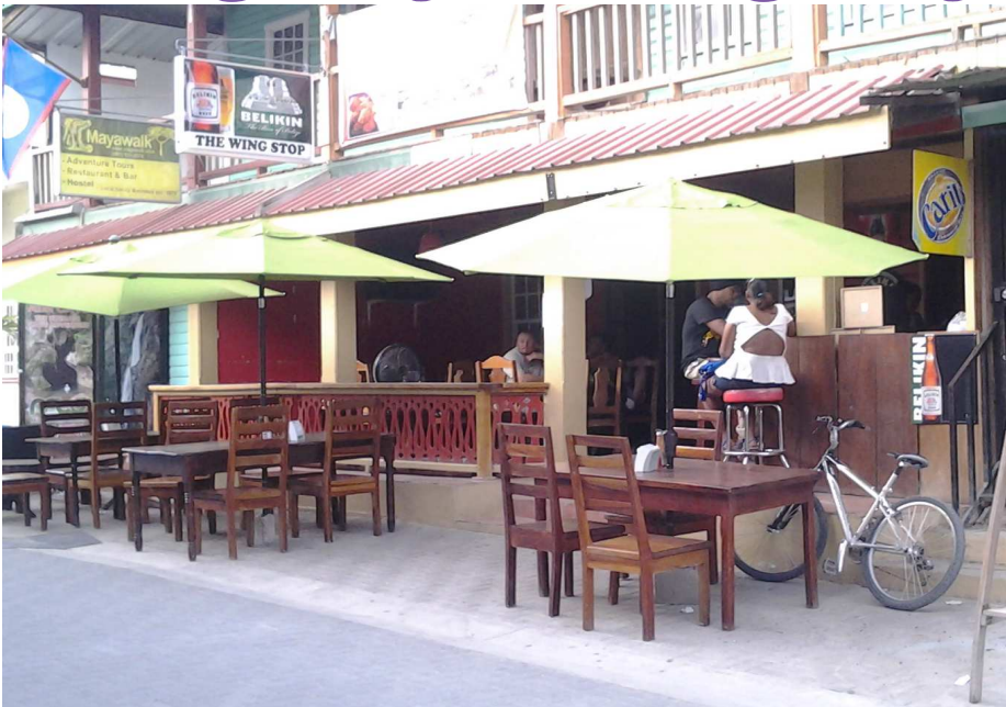
Wing Stop Restaurant