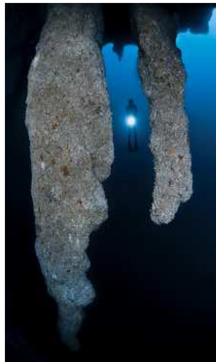
The Great Blue Hole

Belize was also recognized for its “ macro critters. ” Belize, known for some of the most authentic experiences, was also pointed out as