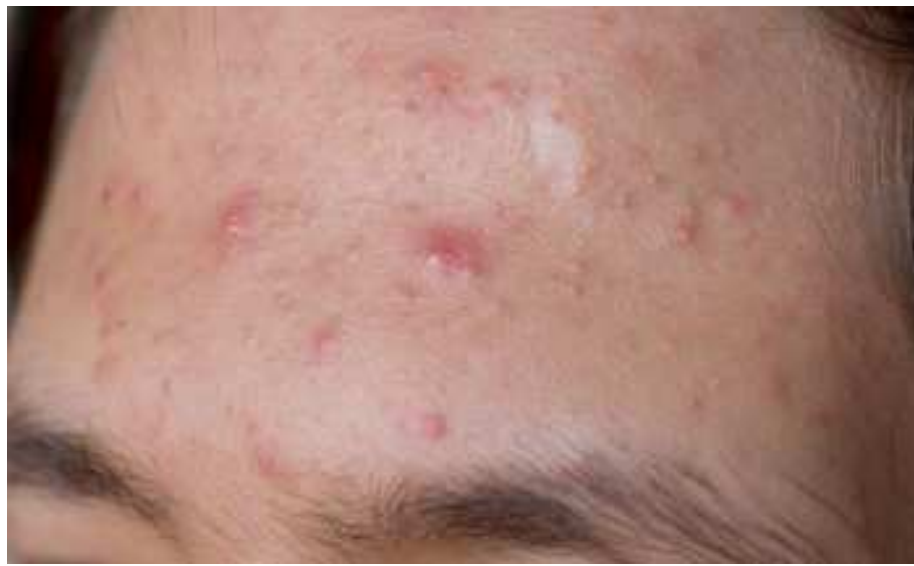
Acne, medically known as Acne Vulgaris, is a skin disease that involves the oil glands at the base of hair follicles.

on the face, back, chest, shoulders and neck.