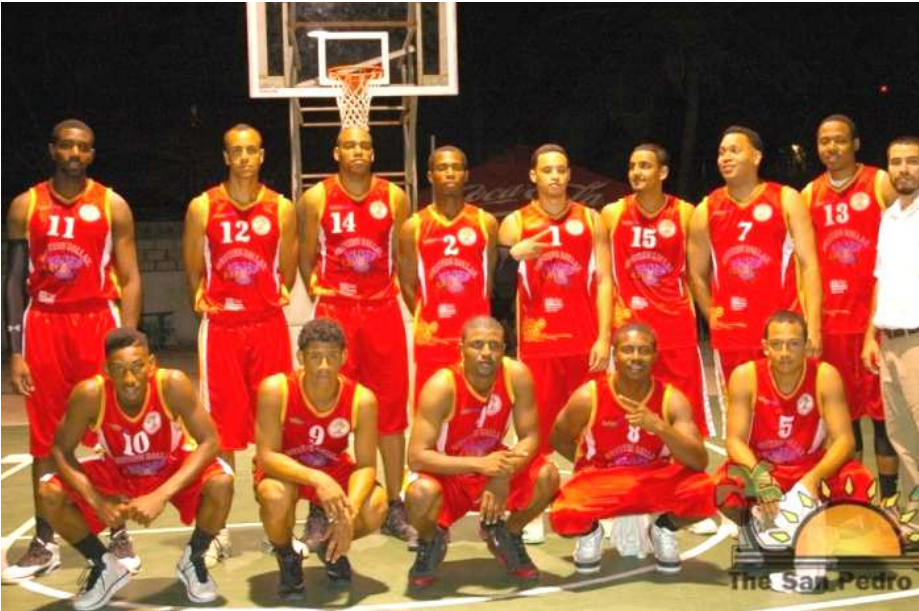
Sub Champs, Cayo Western Ballaz

players. The season schedule for all games will be released next week. Fans can follow the season on our website at www.nebl.sportingpulse.net , where all the scores, standings, players stats, teams stats, league news, game stories and links to live box scores and game stats. The league is anticipating an excellent season for basketball, as all teams have invested countless hours in training and administrative preparation.