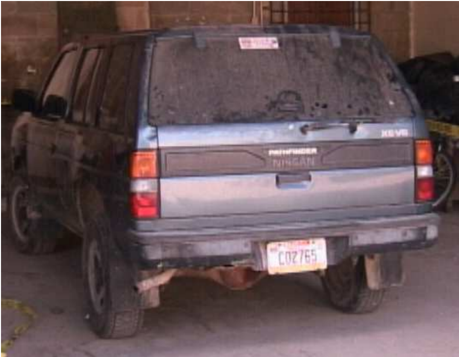
Uncle's Vehicle that Emerson borrowed that night

lead when the vehicle, he was last seen driving, was found abandoned on Mount Pleasant Road located