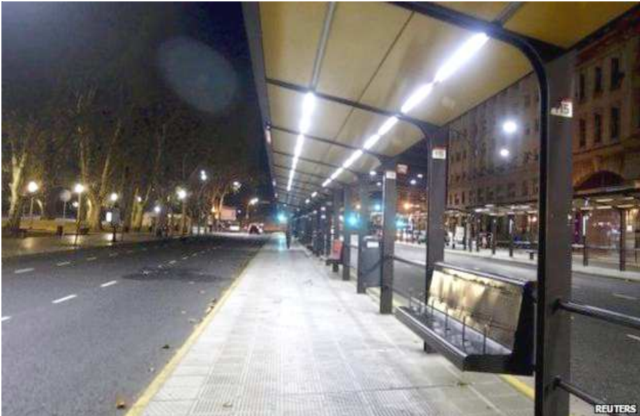
An empty bus stop is seen during a one-day nationwide strike in Buenos Aires

Protesters blocking the Pueyrredon Bridge, one of the main access routes into the city, said they would keep the blockade going until at least midday. Strike leaders said buses would not run on Tuesday as drivers were heavily unionised